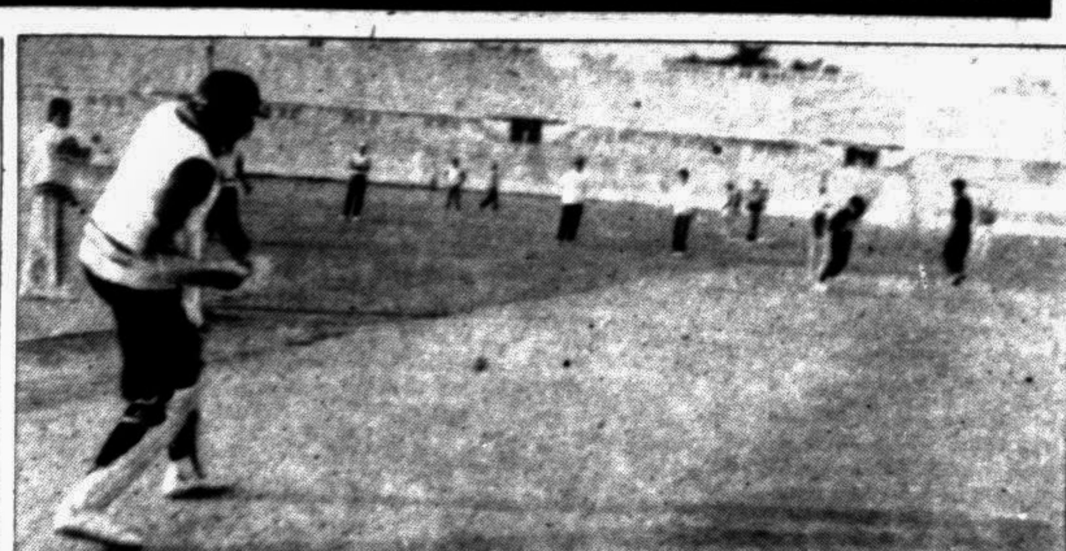
With just two days to go for the Gold Leaf One-day series, between Bangladesh and Pakistan, local cricketers hone themselves up to take on the world champions with the best possible preparation...