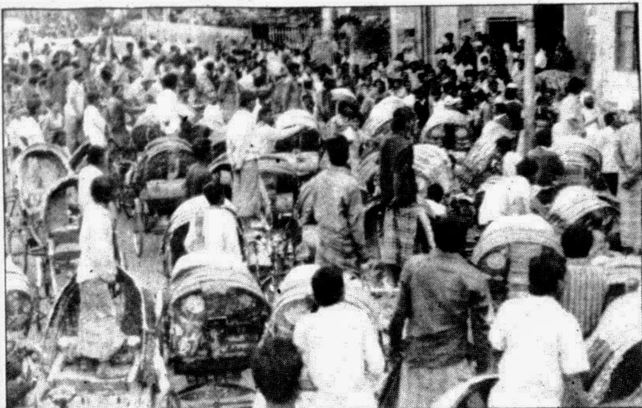
A large number of agitated rickshawpullers yesterday protesting in Motijheel Commercial Area against an alleged assault of a fellow-puller.