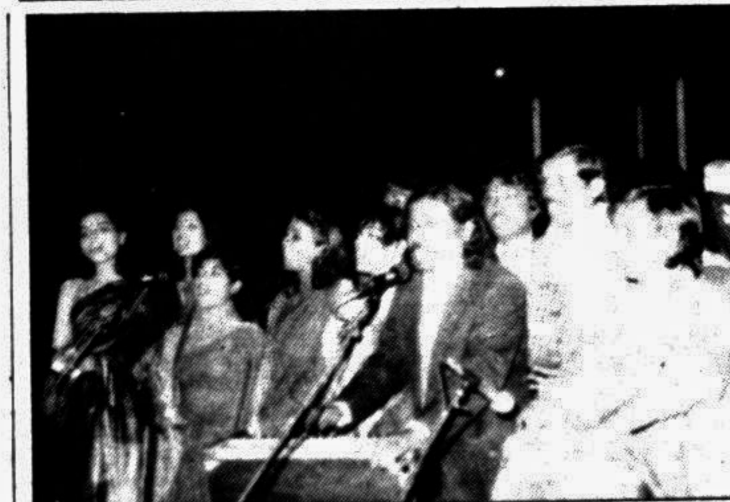
Risij musical group yesterday performing on the TSC road island of Dhaka University to mark the Asad Day.

It further stated 'we would therefore urge all to protest against such unjust forms of salish. We demand that the government take immediate action to ensure that the local administration abide by the law of the land, under which such acts are a criminal offence; to prevent the abdication of responsibility of government officials and elected representatives, and to deter the Chairman and members of the Union Parishad from imposing arbitrary settlements. Further we call upon the members of the Parliament to take steps to make fatwas and other customary practices subject to the law of the land.'