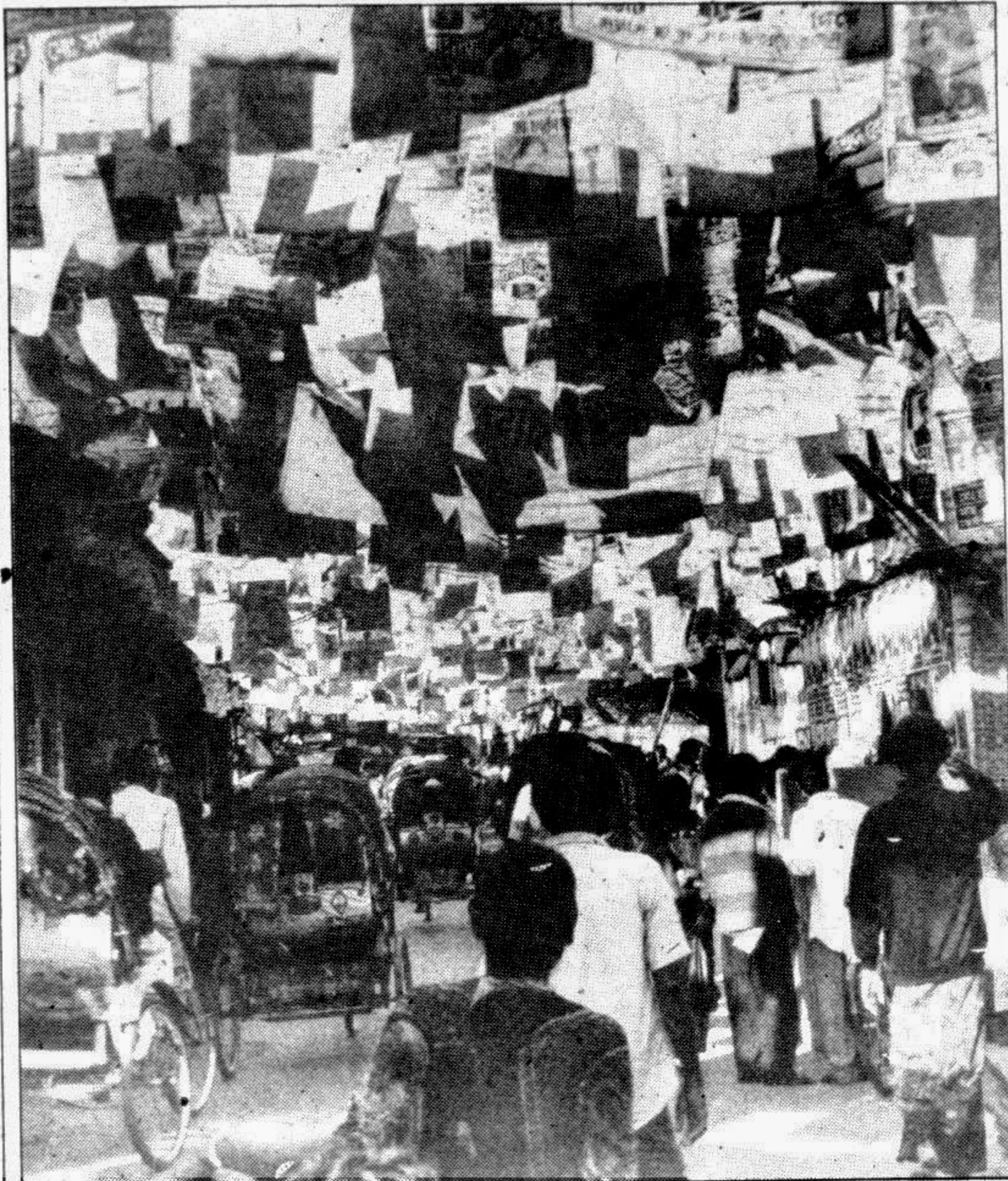
Posters of all parties and candidates for the Jan 30 DCC polls hang over the narrow B K Das Road in Sutrapur in the older part of the city, blocking the sunlight, even at midday yesterday.