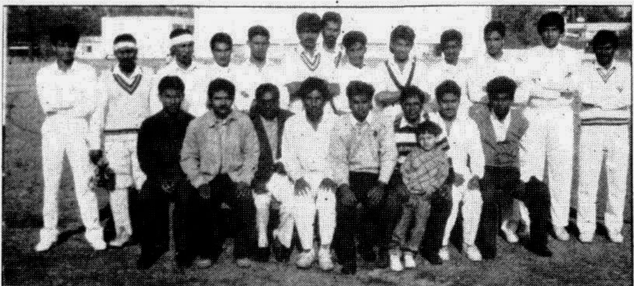
Players and officials of Eskaton Sabuj Sangha who confirmed a place in next year's Navana Premier Division cricket league beating Wanderers Club by eight wickets in their penultimate match of the Milnars league yesterday. Sadharan Bima booked the other promotion berth.