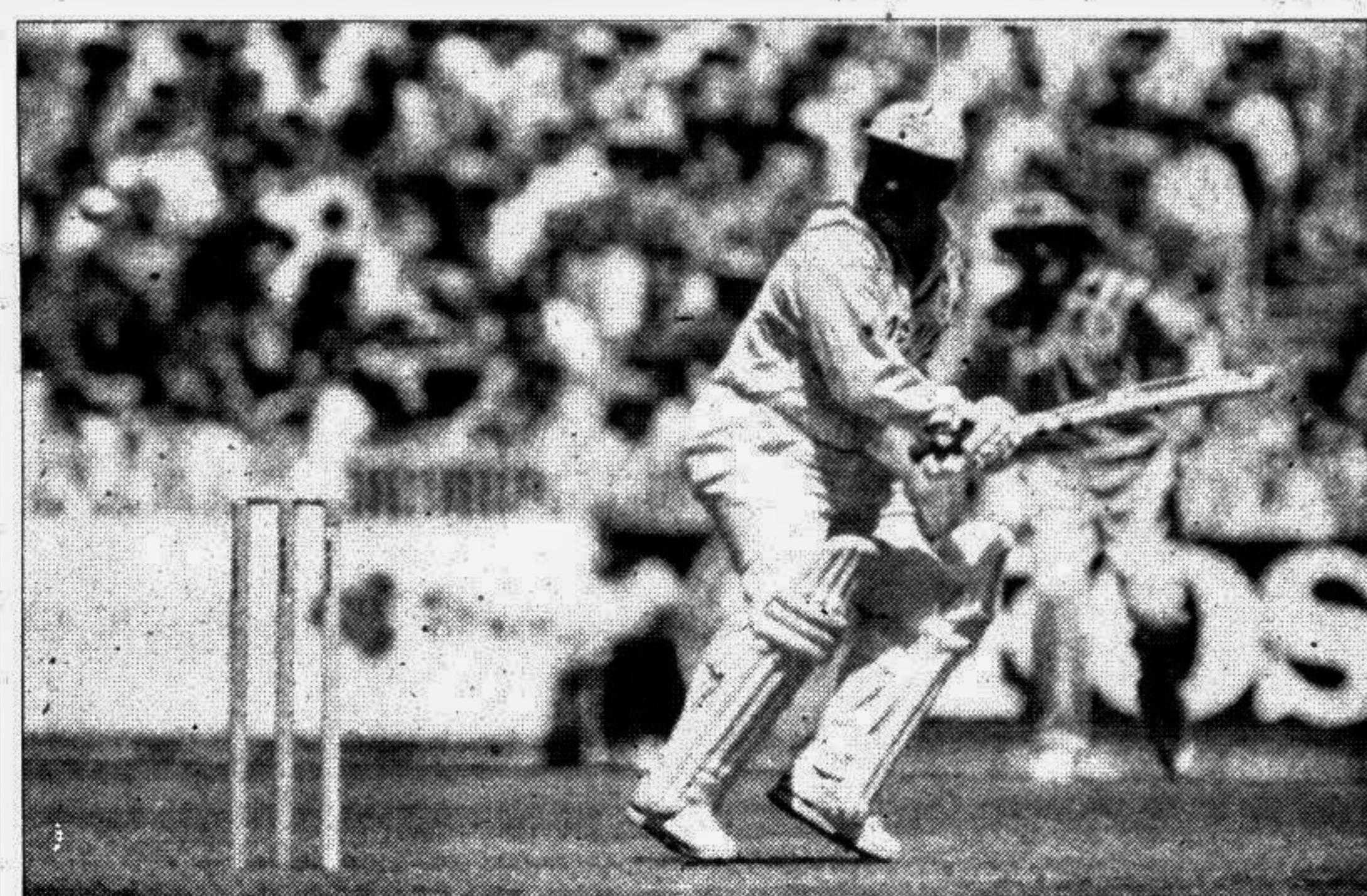
David Boon watches anxiously the ball go closely past the wicket after the Australian opener, attempting a square cut off Chris Cairns only managed a thick inside edge during the World Series Cup match against New Zealand in Melbourne yesterday.

Relegated to the Second Division in 1977 after playing only two years in the First Division, Shantinagar will play again in the First Division after a lay-off of 16 years.