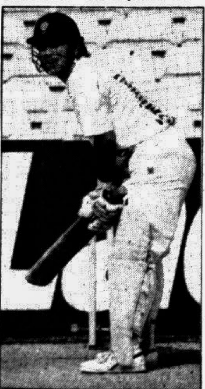
TENDULKAR ... 142

who made his international debut in 1989 and is already the team's vice-captain, now