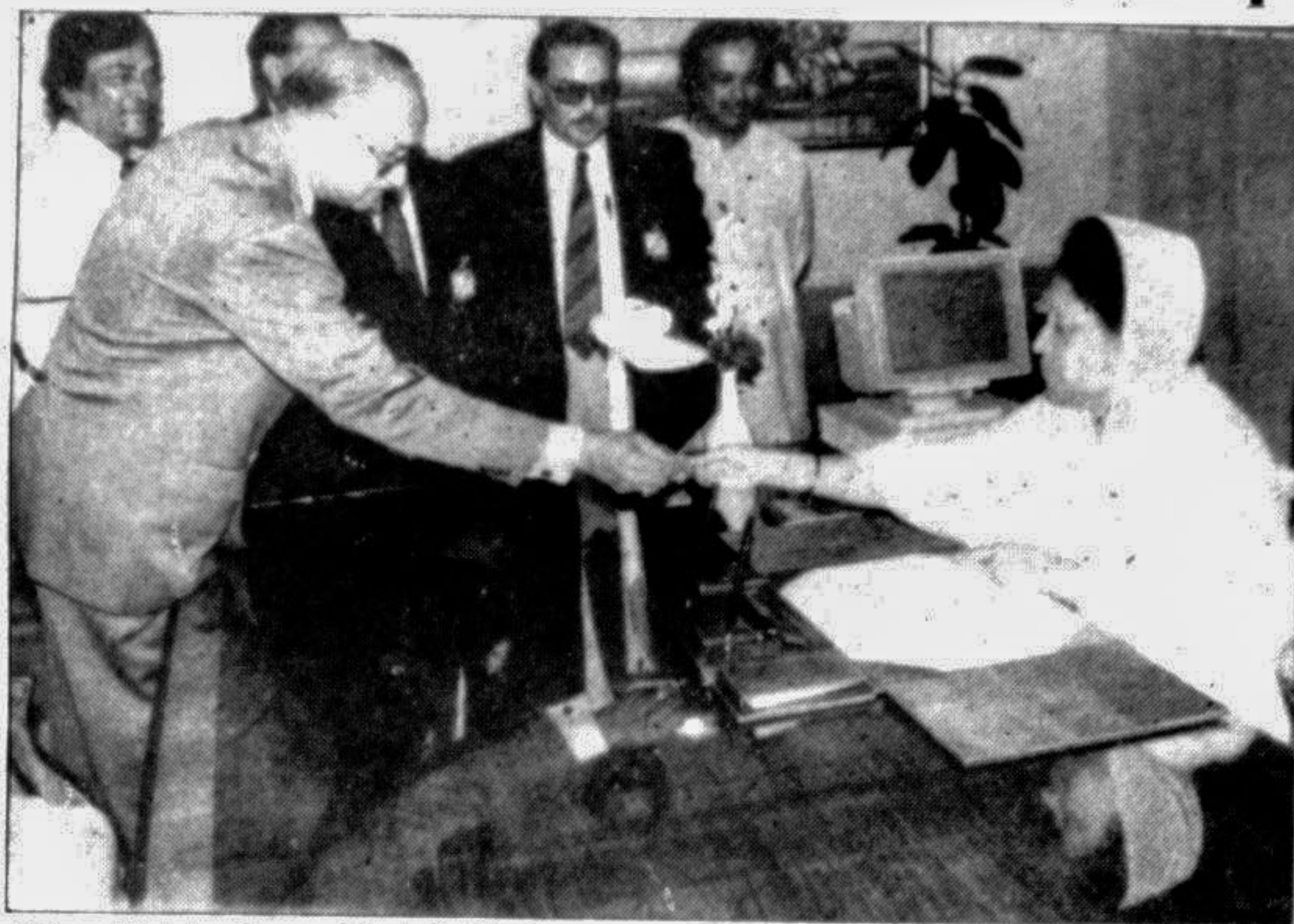
Prime Minister Begum Khaleda Zia inaugurating the sale of tickets by purchasing a ticket from chairman, Bangladesh Cricket Control Board Foreign Minister A S M Mostafizur Rahman at her office in Dhaka yesterday for the two one-day exhibition cricket matches between Bangladesh and Pakistan to be held in Dhaka on January 23-24.

Prime Minister Begum Khaleda Zia yesterday inaugurated the sale of tickets for the two one-day exhibition cricket matches between Bangladesh and Pakistan to be held here on January 23 and 24, reports BSS.