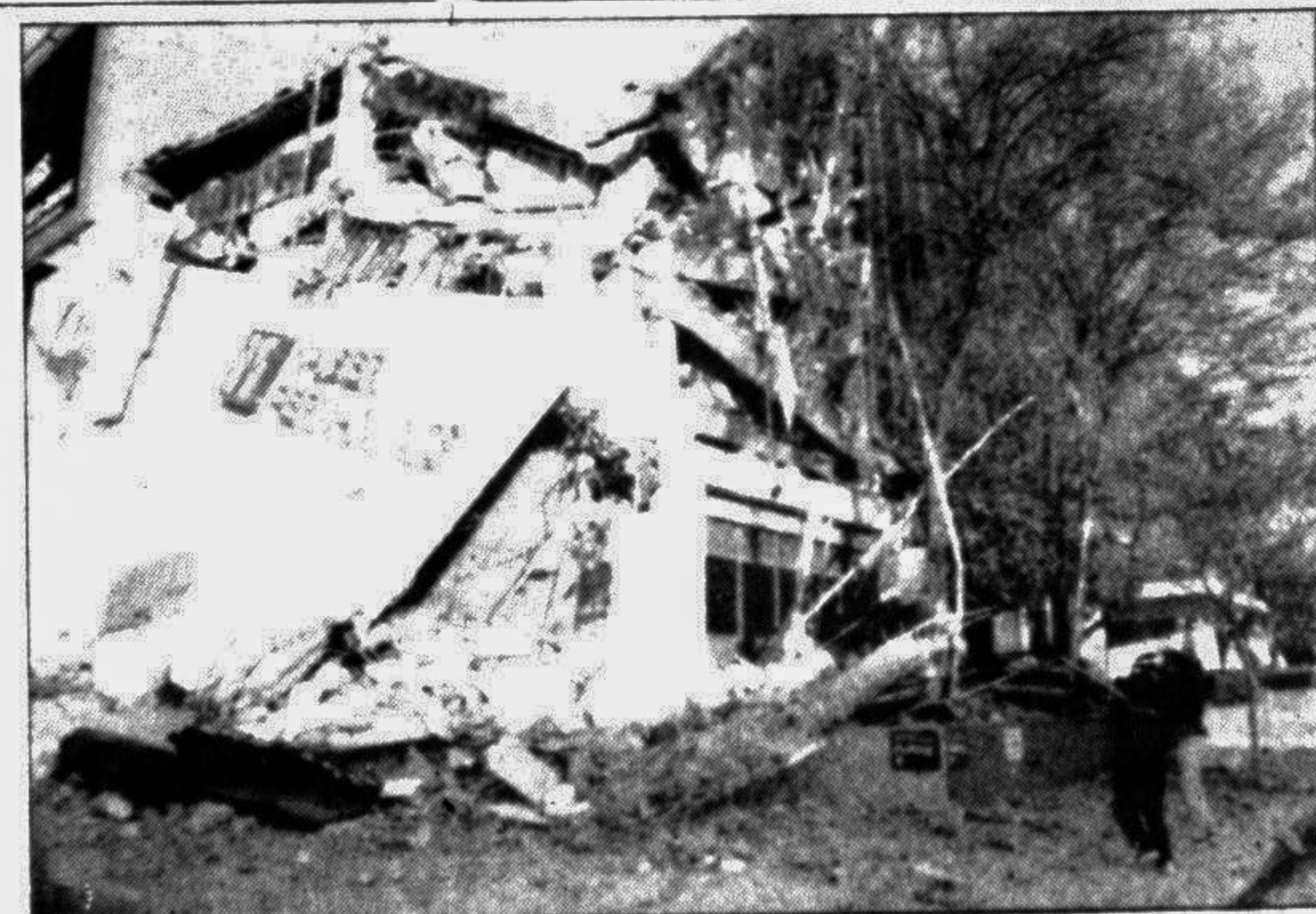
Survivors looking at damages to the buildings in the Granada Hills in California following an earthquake measuring 6.6 on the Richter scale that hit the southern part of the state in the United States of America yesterday.

Inman 62 ended three decades of government service in 1982, when he resigned as deputy director of the Central Intelligence Agency.