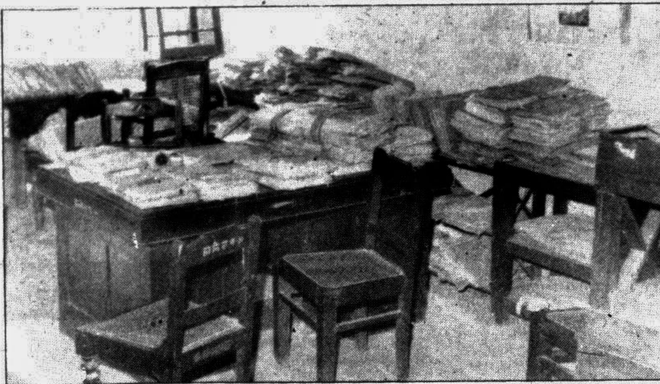
Inside view of a room of the Dhaka University Registrar Building — the officers of the varsity went on strike from yesterday.