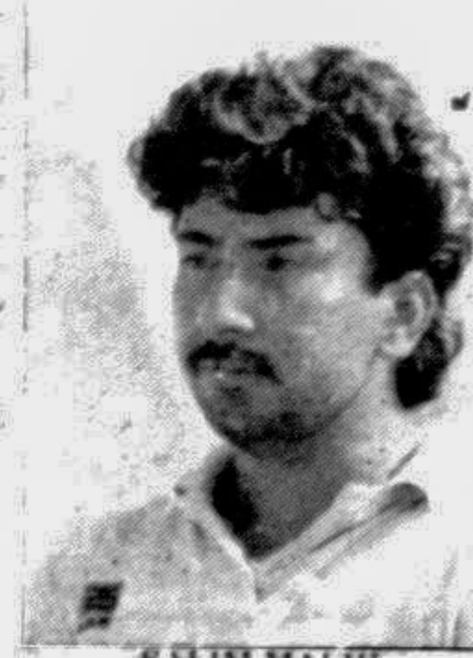
SALIM MALIK manager to "ensure discipline outside the ground."

He said Intikhab Alam, earlier appointed manager, would now act as game manager while "former Test cricketer Majid Khan would be team