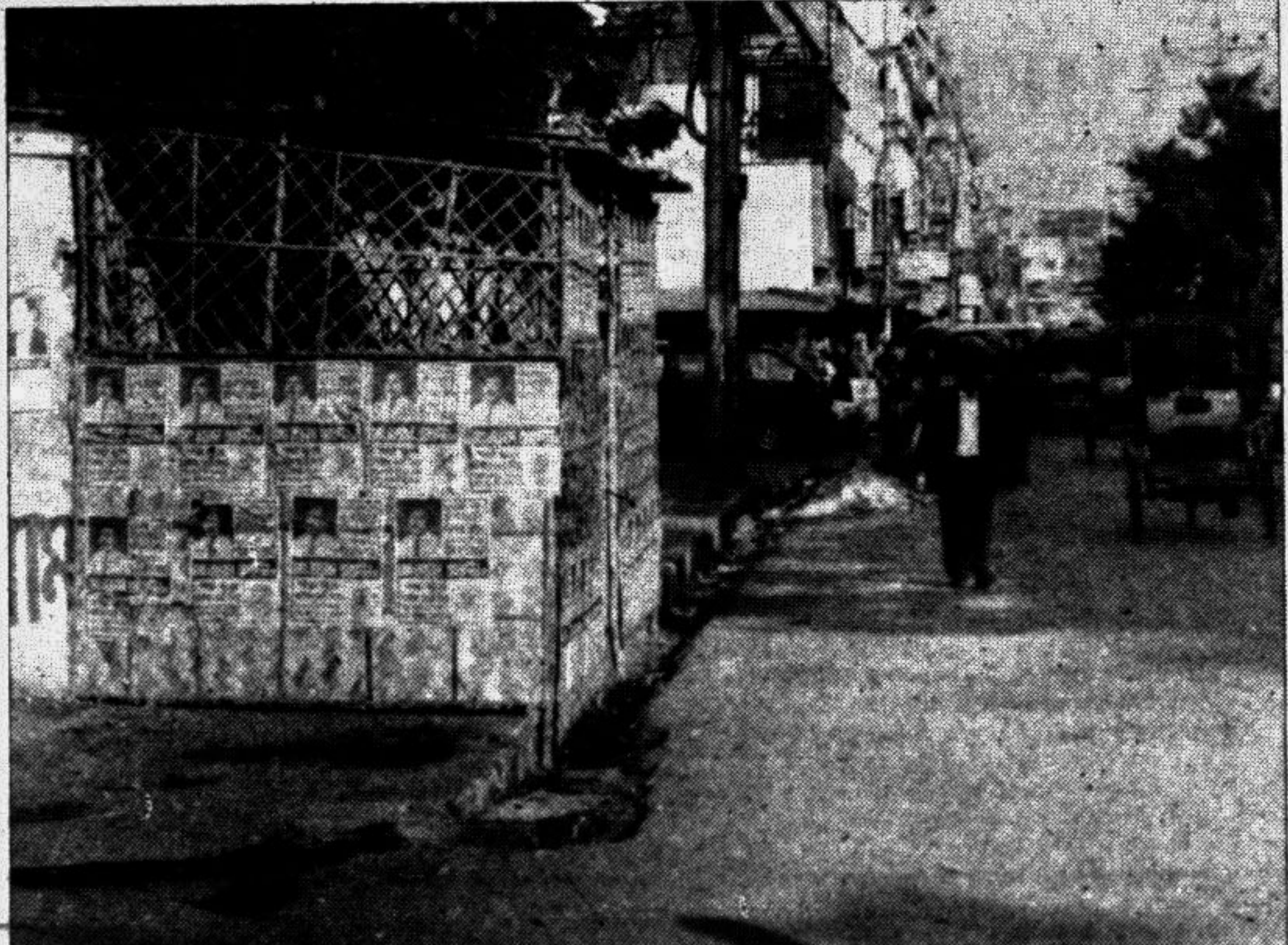
Make-shift election camps erected on the roads and pavements for the upcoming January 30 city corporation polls remain in place despite the Election Commission — political parties' decision on January 13 to remove them immediately.