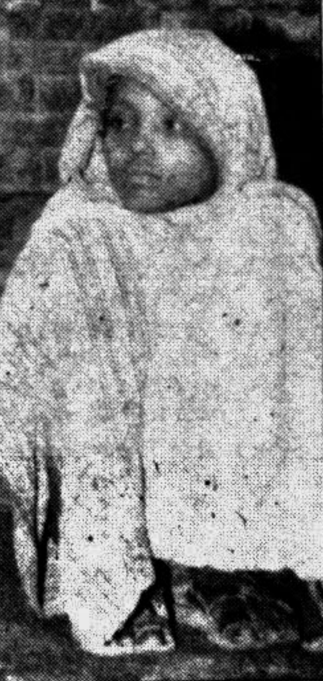
It was quite cold yesterday.