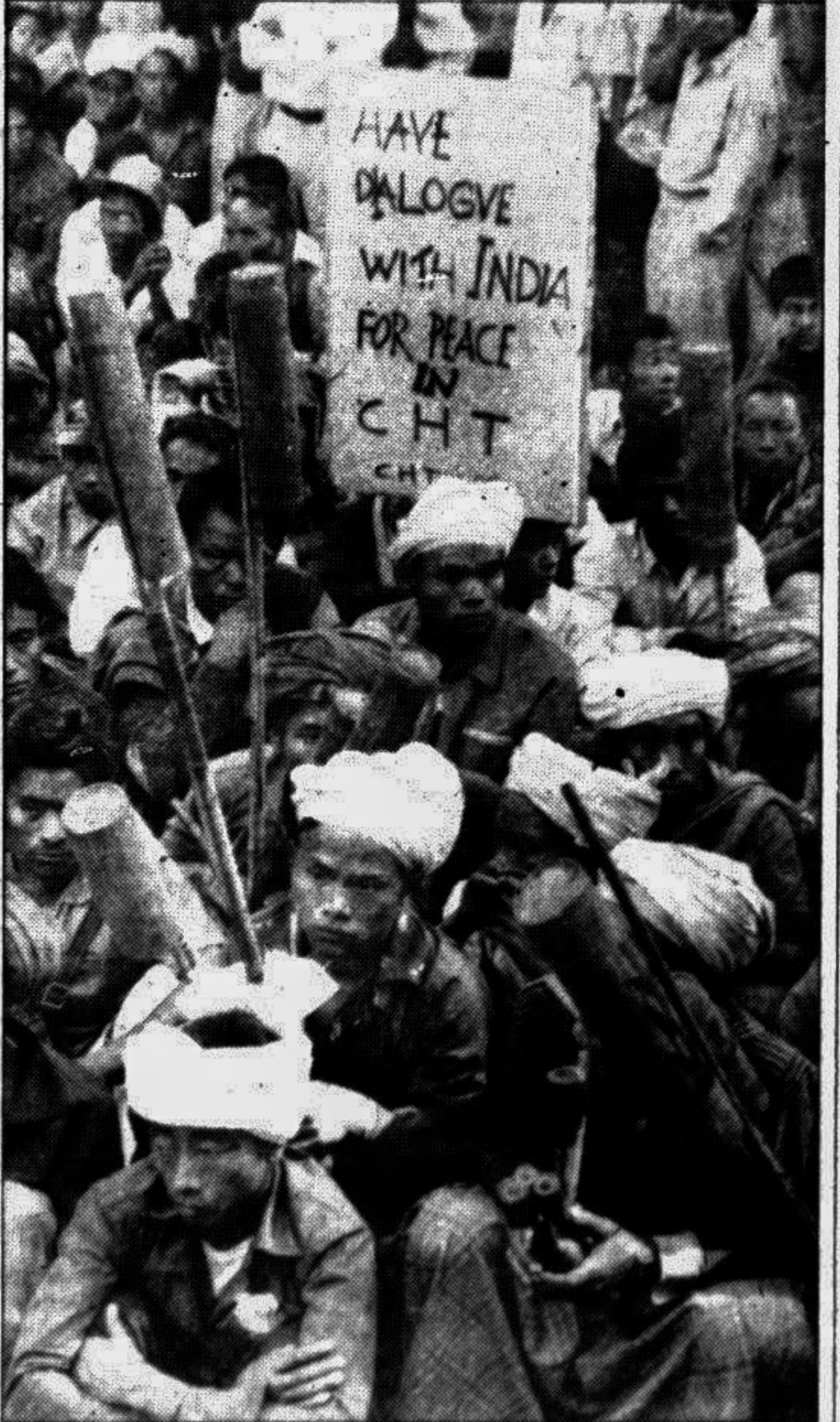
A section of the tribal participants of a long-march from the Chittagong Hill Tracts seen near the National Press Club in the city yesterday.