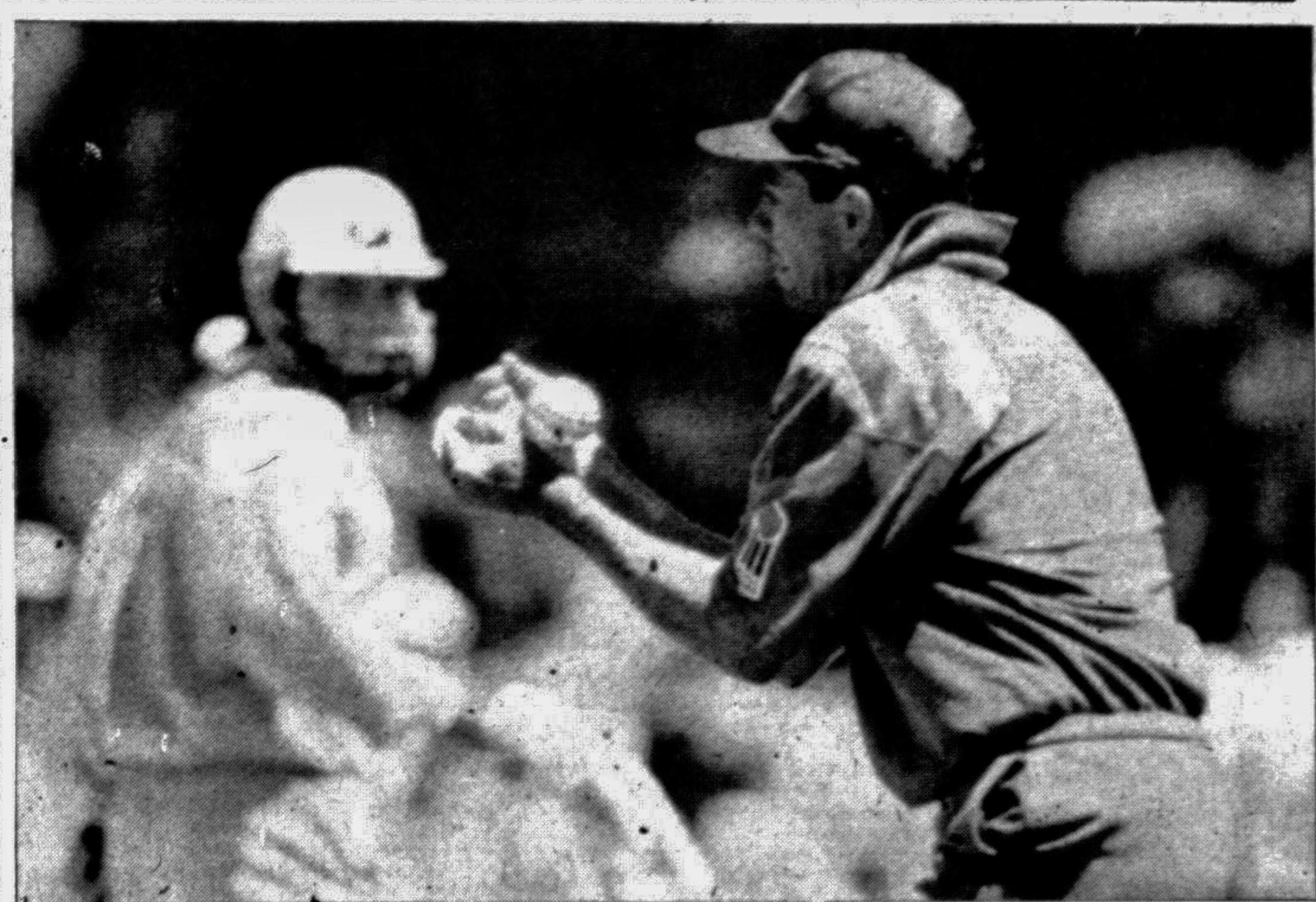
South African captain Hansie Cronje fumbles a simple catch during his team's World Series Cup one-day match against New Zealand in Perth yesterday. South Africa won by five wickets to stay in contention for the finals.