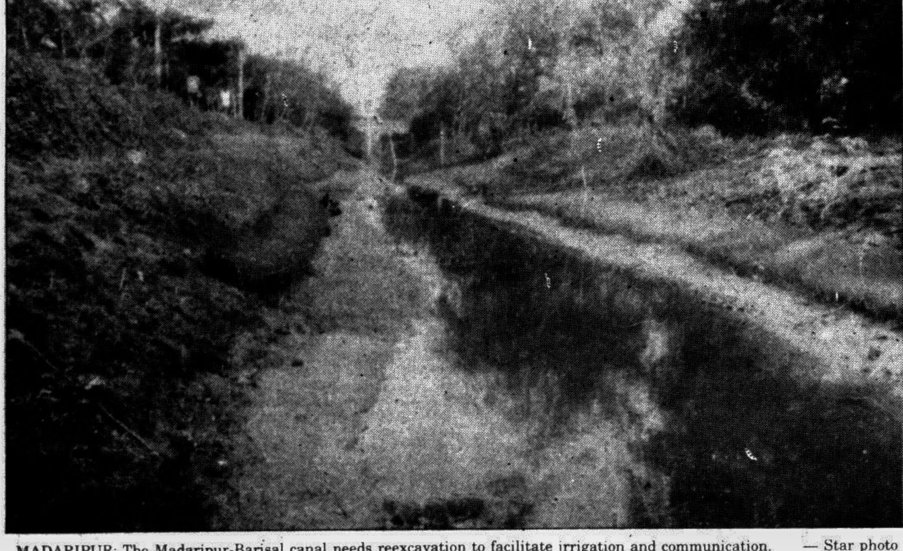
MADARIPUR: The Madaripur-Barisal canal needs reexcavation to facilitate irrigation and communication.