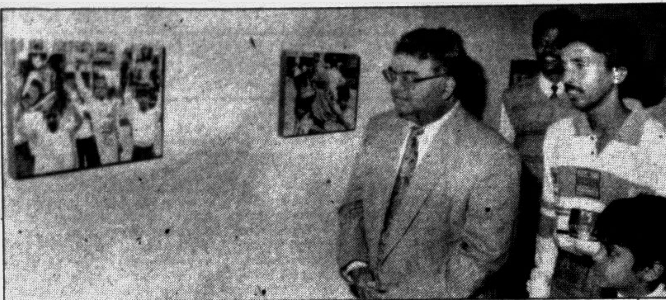
Information Minister Barrister Nazmul Huda inaugurated a solo photography exhibition of Abu Taher Khokon, staff photographer of the Morning Sun at the art gallery of the Shilpakala Academy yesterday.