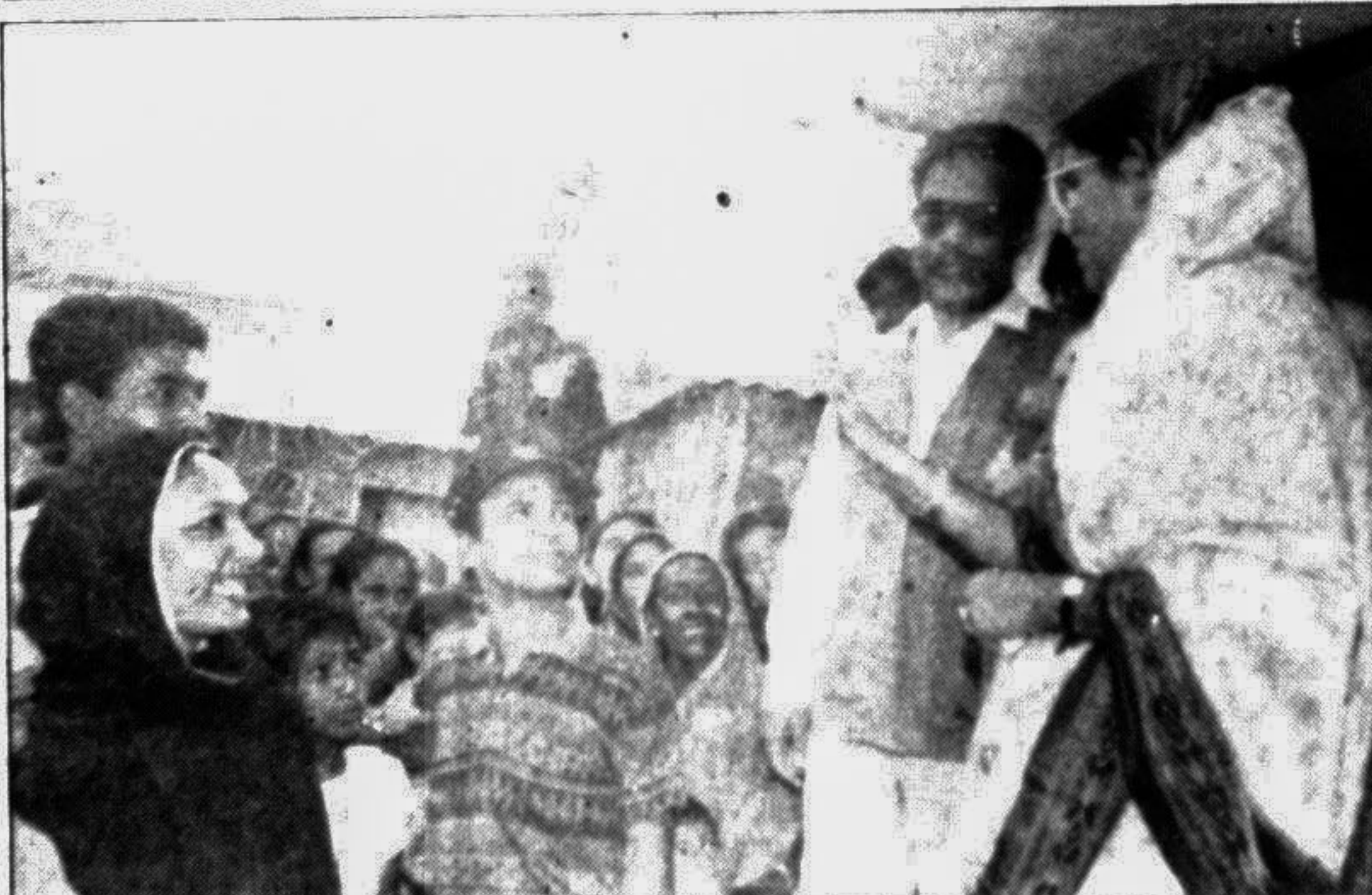
Awami League chief Sheikh Hasina seeking votes for her party candidates contesting the DCC elections during door-to-door campaigning in the Sobhanbagh-Tollabagh area of the city yesterday