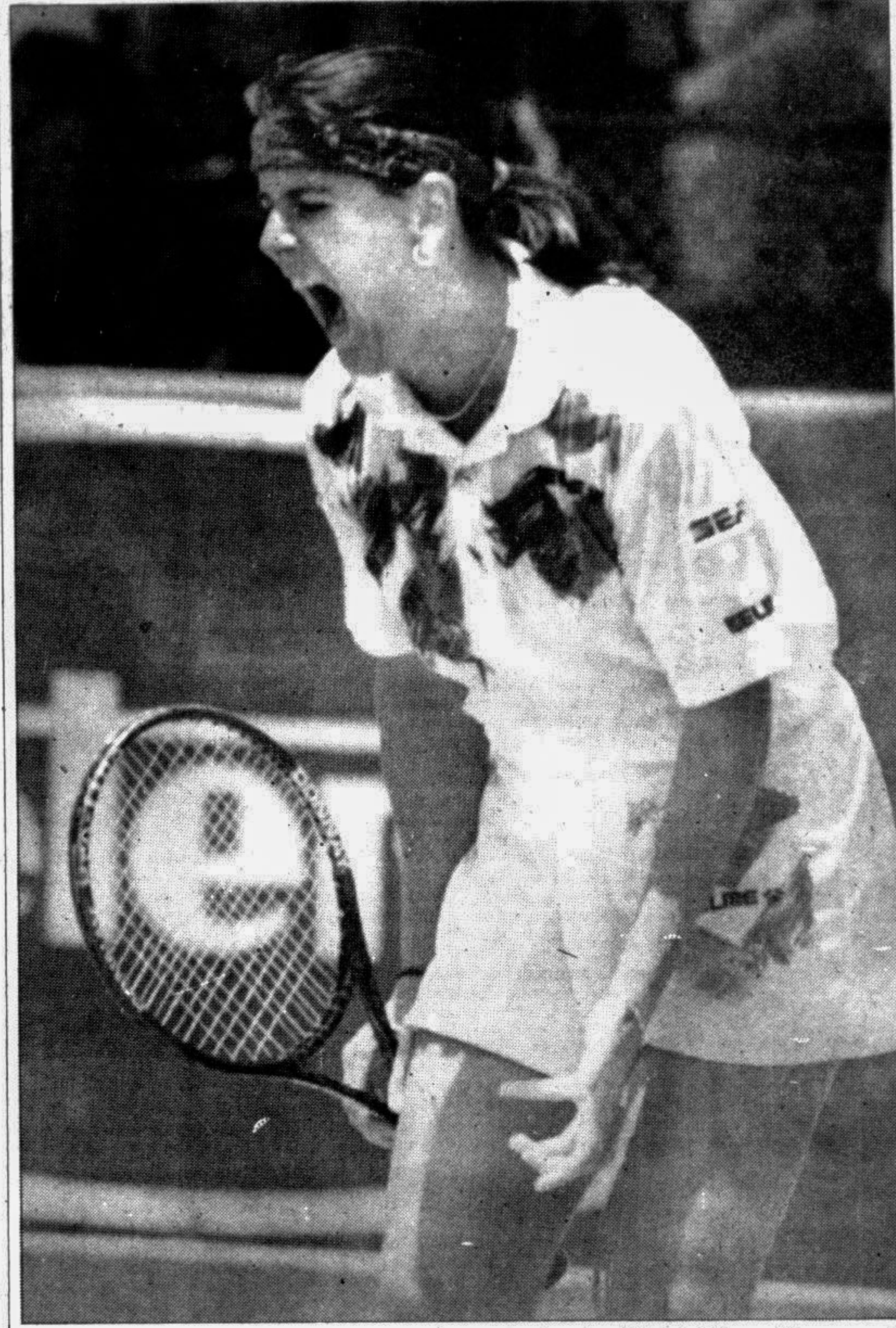
Conchita Martinez of Spain is really pumped up after beating Wiltrud Probst of Germany at the New South Wales Open in Sydney yesterday. She won 2-6, 7-5, 6-2.