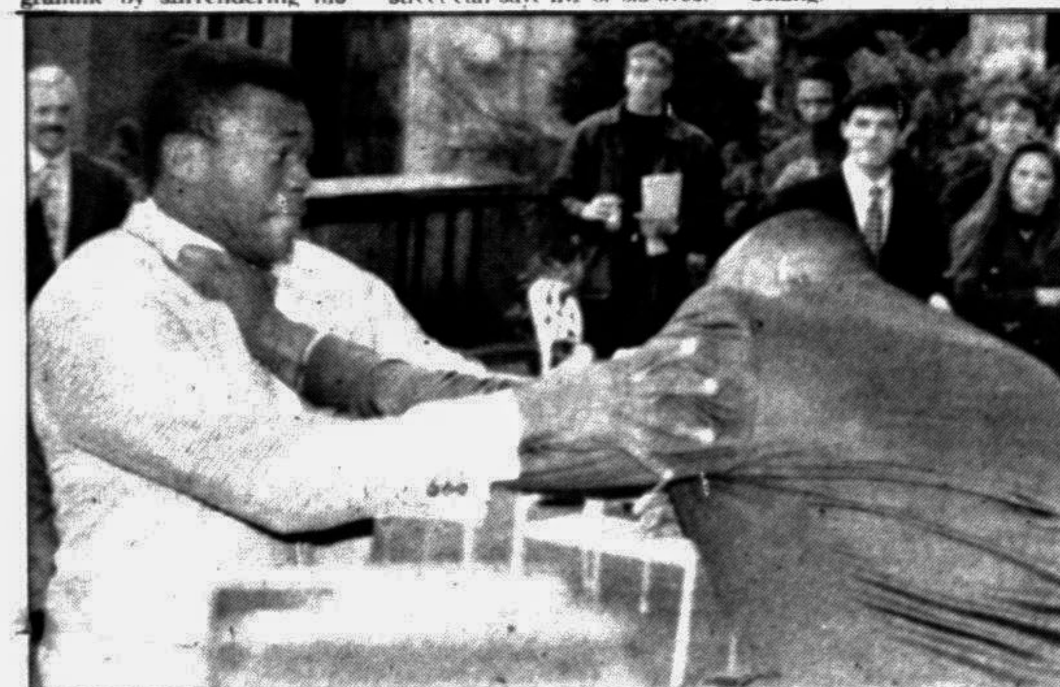
World Boxing Organisation (WBO) champion American Michael Bennit (R) and British challenger Herbie Hide (L) have go at each other after their press conference in London on Jan 10, two months ahead of their coming bout.

"Every gun we take off the street can save five or six lives."