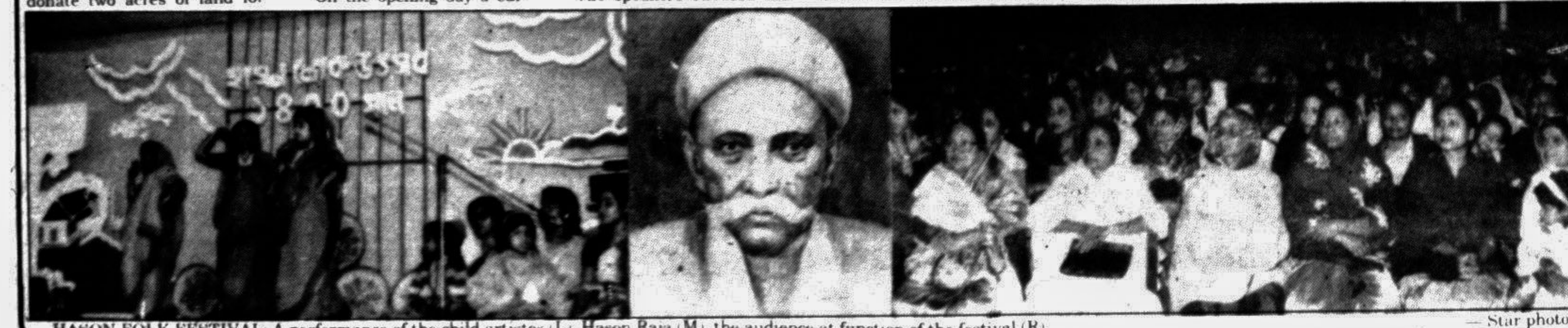
HASON FOLK FESTIVAL. A performance of the child artistes (L), Hason Raja (M), the audience at function of the festival (R).

This year's festival attracted large number of people from all walks of life who enjoyed the function from afternoon to late night.