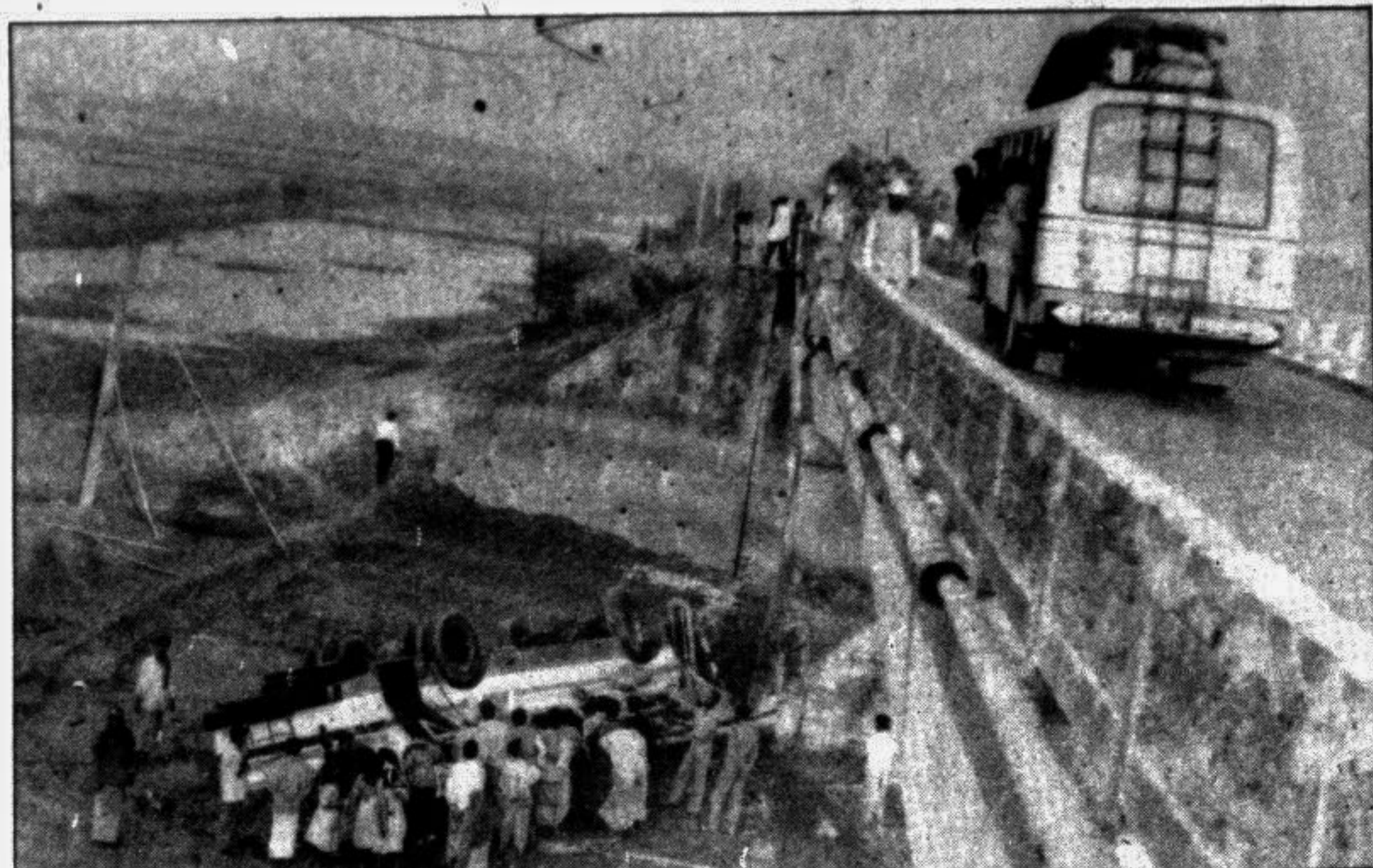
The Dhaka-bound bus from Faridpur which fell 30 feet from a bridge on the Dhaka-Aricha highway yesterday killing 18 people on the spot and seriously injuring 26 others.

NEW DELHI, Jan 12: Prime Minister P V Narasimha Rao, will pay an official visit to Germany from February three, after attending the World Economic Forum meeting in Davos, Switzerland on February one, reports PTI.