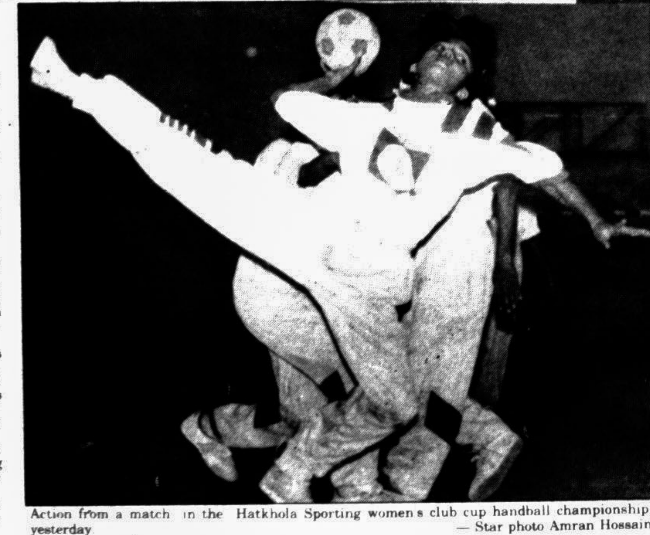
Action from a match in the Harkhola Sporting women's club cup handball championship yesterday