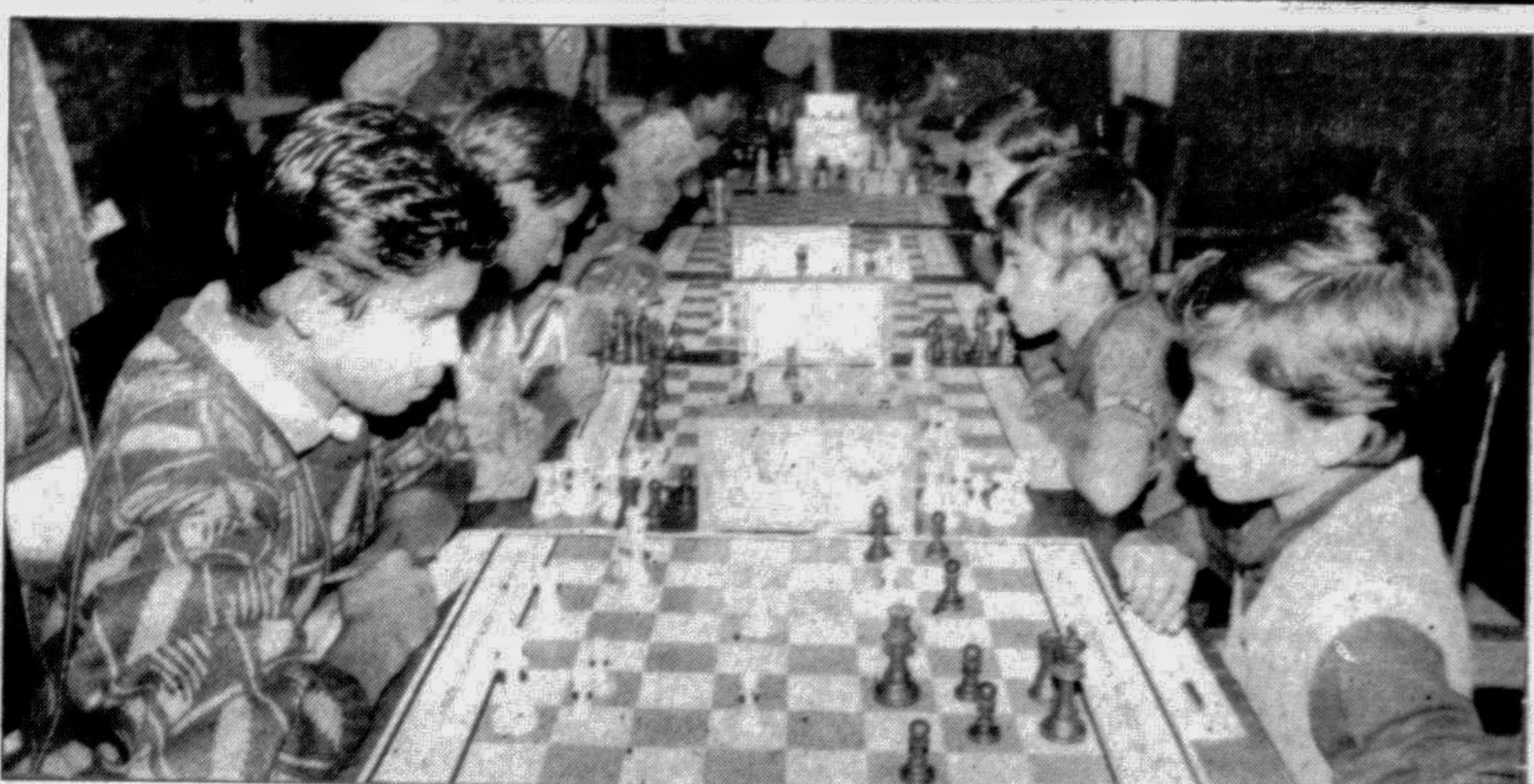
Participants in the seventh round of the national sub-junior chess championship at the chess room of the National Sports Council yesterday.

Six teams including two from Dhaka and four from outside the capital are taking part in this week-long meet.