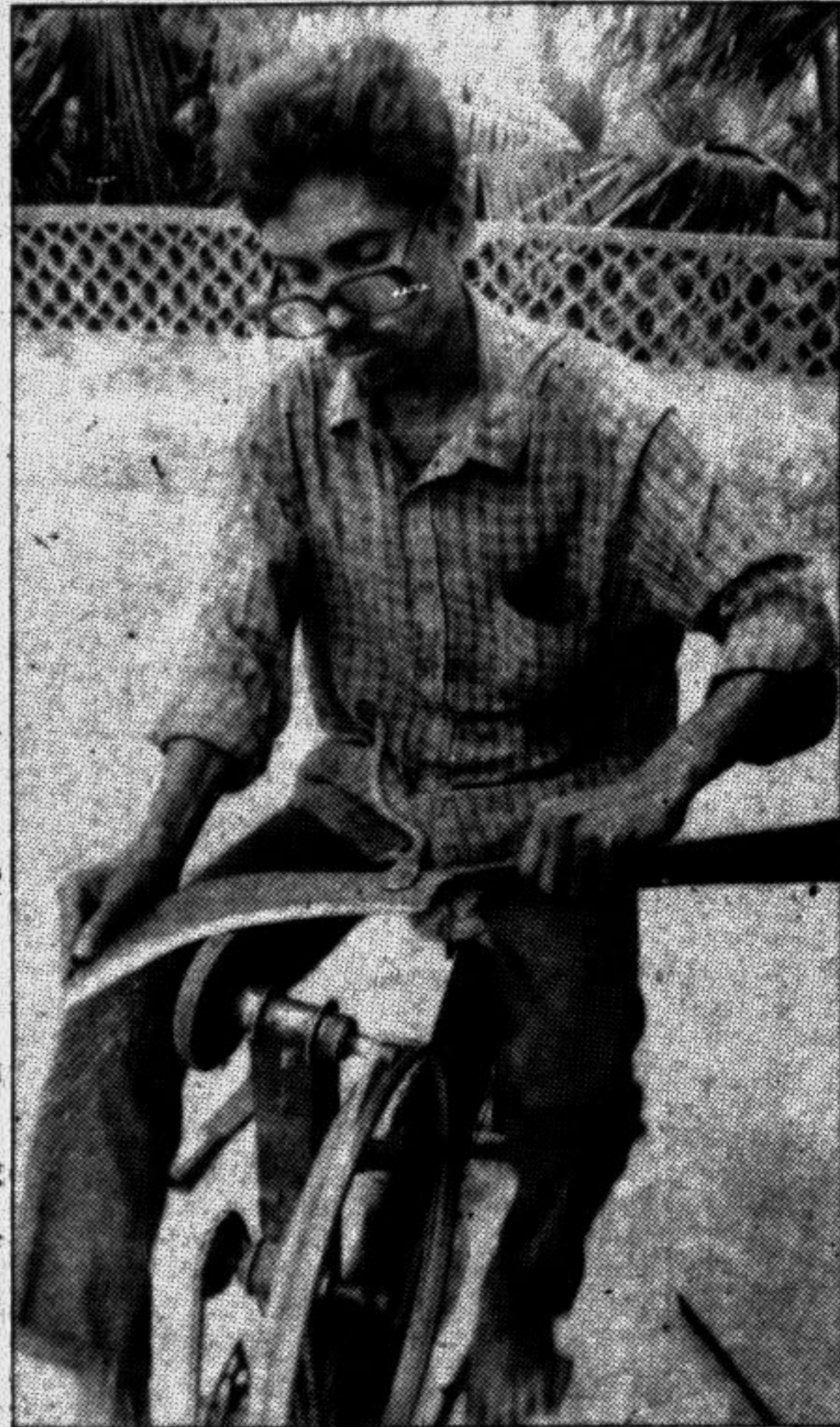
Knife-grinder at work

It saddens the sentimentalists amongst us to see these indigenous arts slowly being eased out in the face of stiff competition from modern methods. Before long, a generation will come along which will probably only read about these men and their trade in history books; again the way the history books are distorted at the drop of a hat to suit the whims of whoever is at the helm of affairs, it is doubtful if history books will indeed reflect the true indigenous folk art or tradition. Someone, somewhere along the line will have to make sure that our priorities stay in their proper perspective.