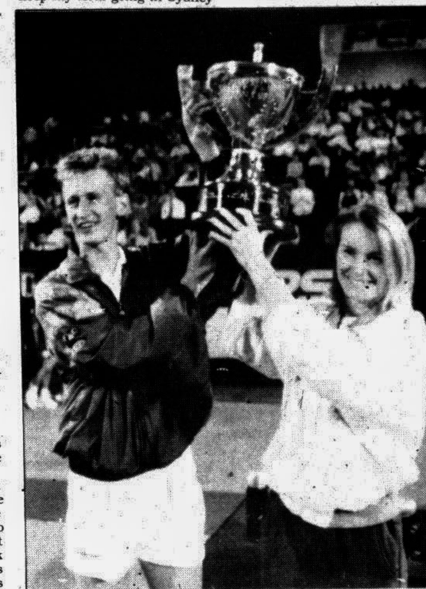
Jana Novotna and Petr Korda of the Czech Republic proudly hold aloft the Hopman Cup after defeating Germany's Huber and Karbacher in the finals in Perth on Jan 7. Novotna defeated Huber 1-6, 6-4, 6-3 in the women's singles and Korda defeated Karbacher 6-3, 6-4 in the men's singles.

The bottle was practically empty by the time Germany won the lone set 8-3, giving the Czechs a final winning margin of 2-1.