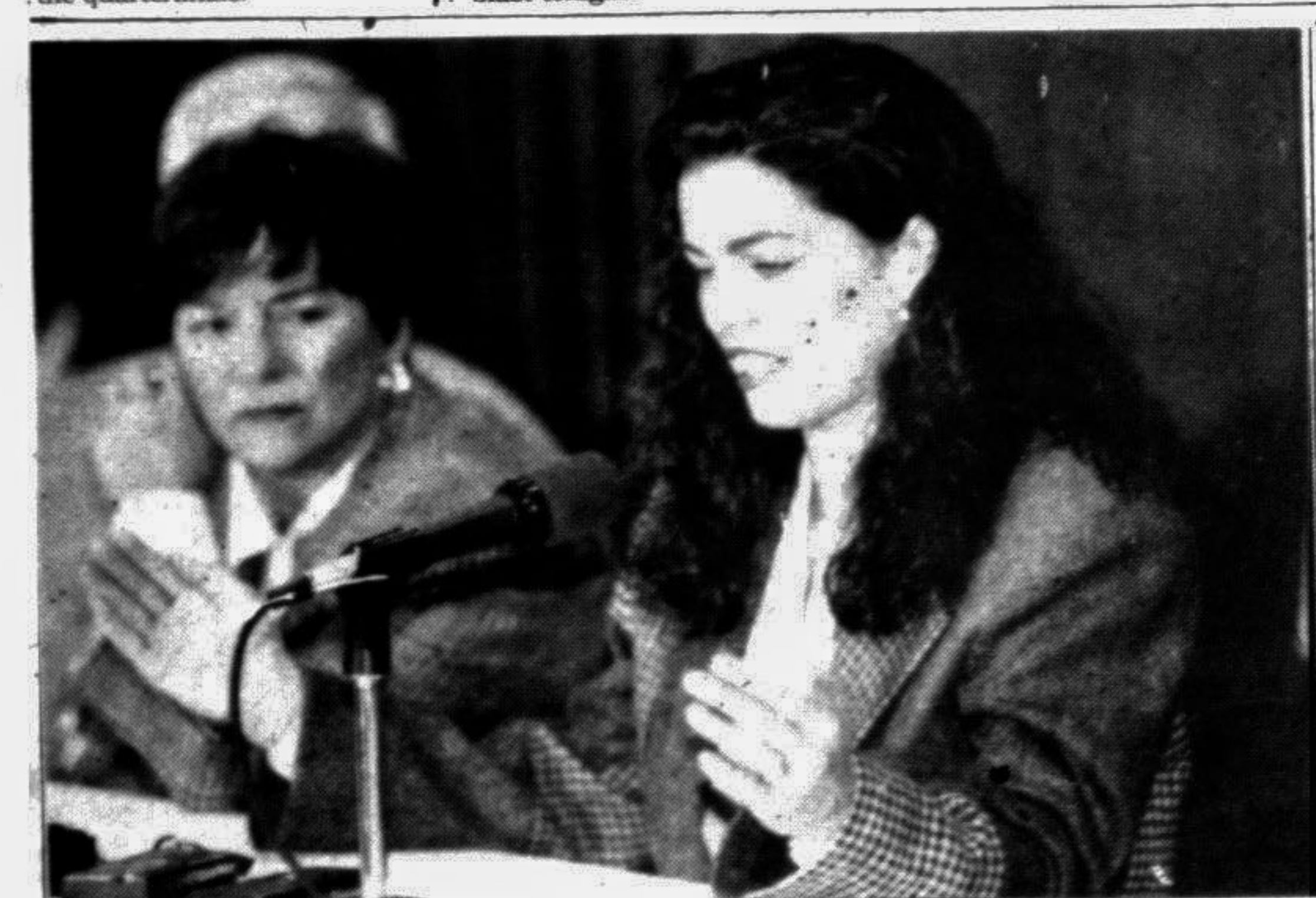
American figure skater Nancy Kerrigan describes the weapon used by an unknown assailant in an attack on her after a practice session for the 1994 US figure skating championship at a press conference in Detroit on Jan 7.