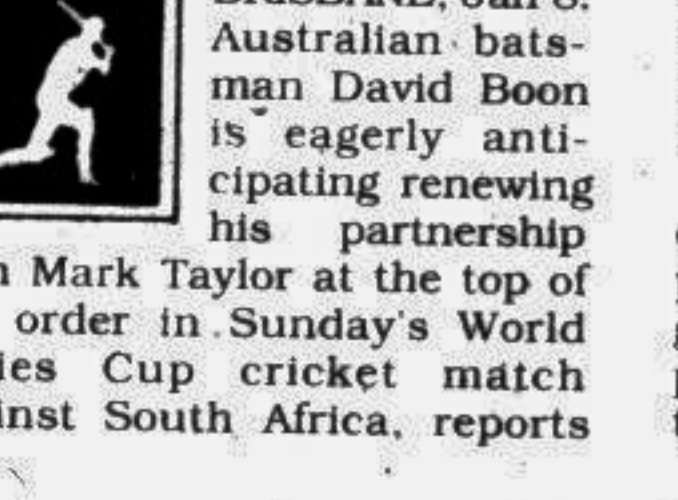
BRISBANE, Jan 8: Australian batsman David Boon is eagerly anticipating renewing his partnership with Mark Taylor at the top of the order in Sunday's World Series Cup cricket match against South Africa, reports AP.

The pair opened the Australian batting during last year's World Series, with Boon also having almost 100 one-day internationals partnering former vice-captain Geoff Marsh. With openers Michael Slater and Matthew Hayden dropped from the Australian one-day side, selectors will choose between Boon and No 4 Mark Waugh as to who will face the new ball. "I don't mind it," said Boon when asked about the opening