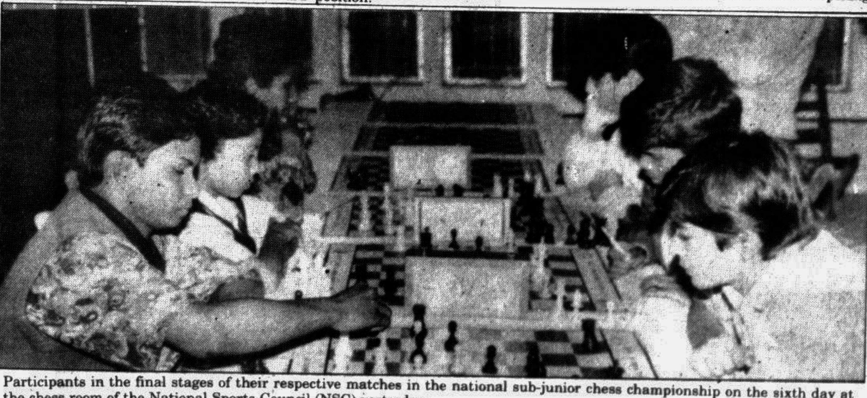
Participants in the final stages of their respective matches in the national sub-junior chess championship on the sixth day at the chess room of the National Sports Council (NSC) yesterday.