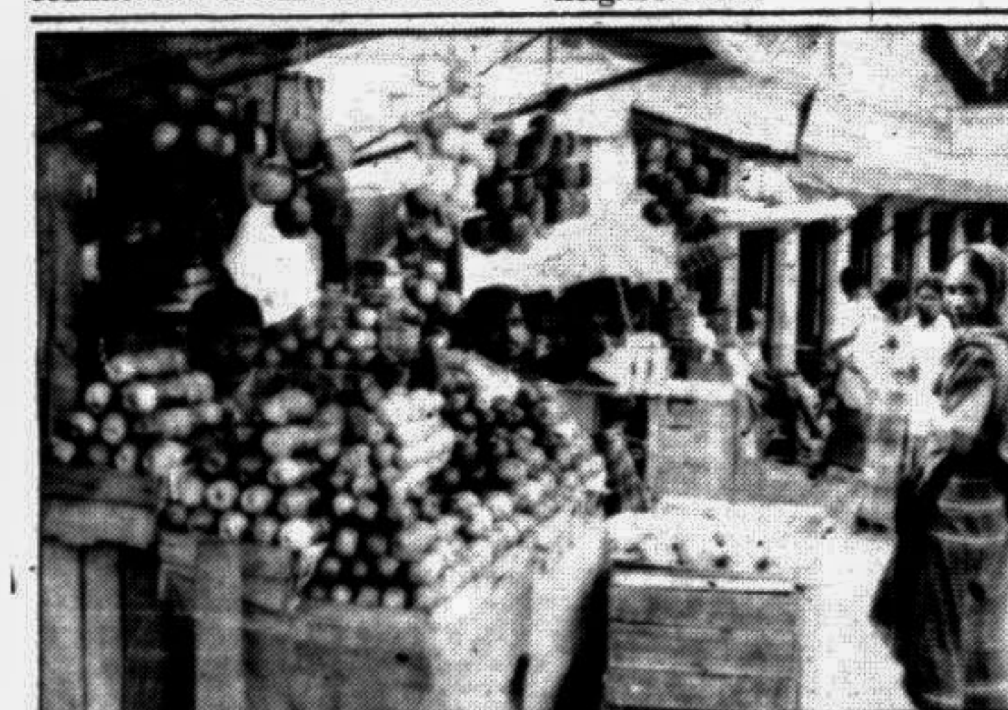
NATORE: The vendors have set up shops on Nichabazar Road of the district town.

According to information, the accused forcibly entered the house who found the victim alone and raped her in mid-day which was witnessed by the neighbours.