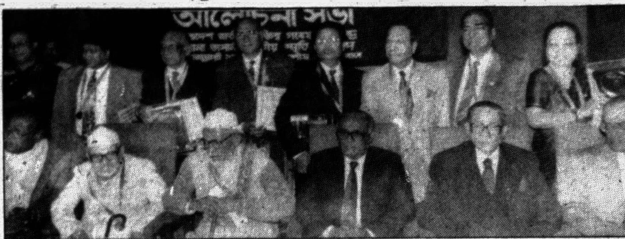
Speaker of the Jatiya Sangsad Shaikh Razzak Ali (seen seated 3rd R) with the recipients of the Moulana Bhasani National Award '92 and '93. The award-giving ceremony was held at PG Hospital auditorium yesterday.