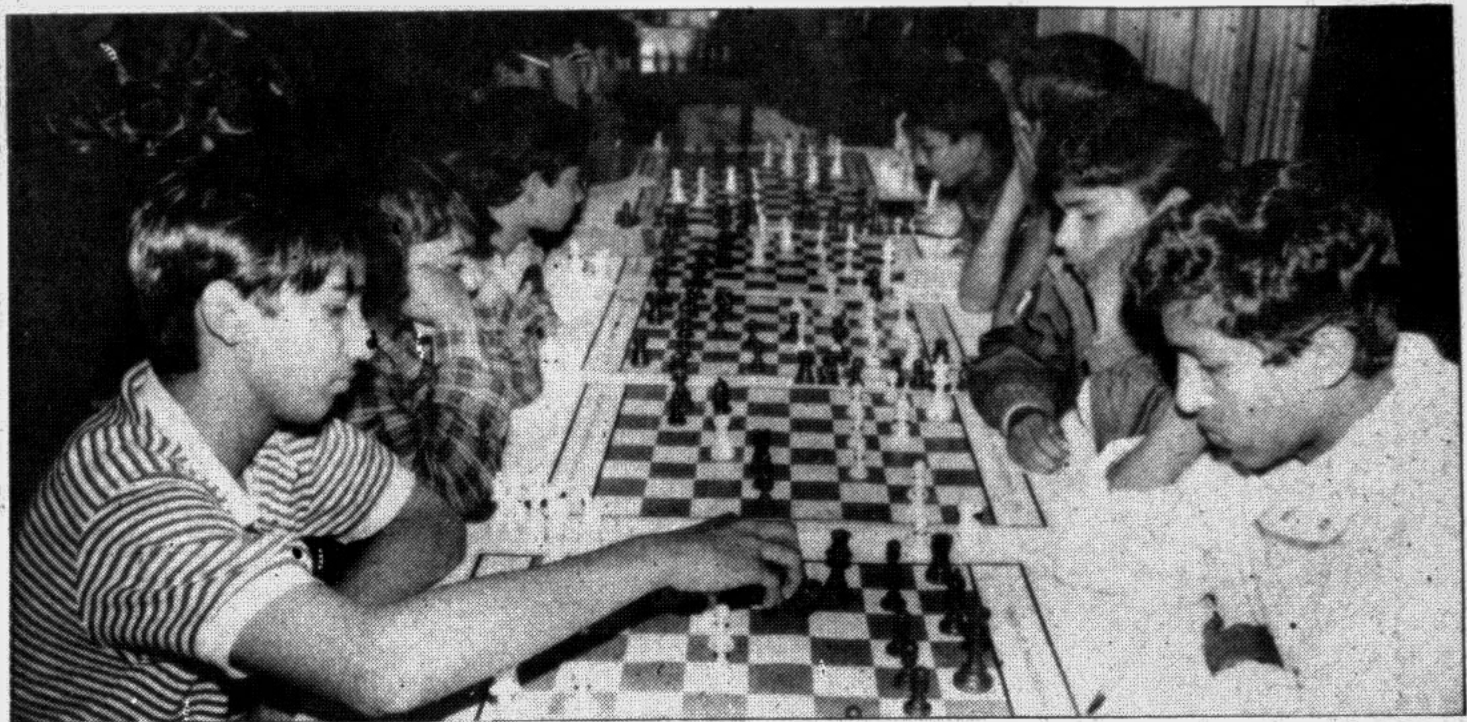
Participants on the fifth day of the national subjunior chess competition at the chess room of the National Sports Council (NSC) yesterday.