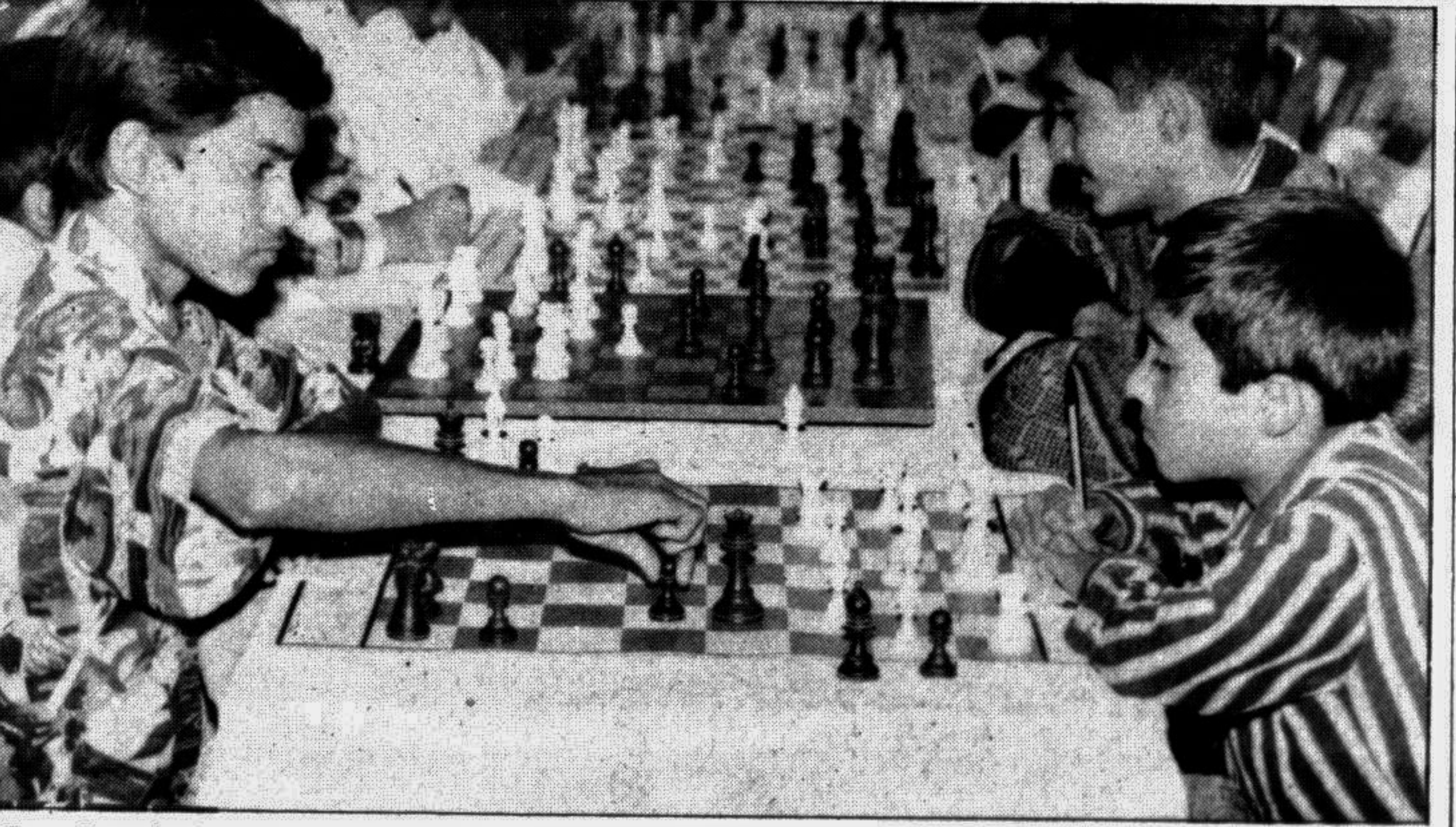
Scene from the fourteenth national sub-junior (under-16) chess championship at the chess room of the National Sports Council (NSC) yesterday.