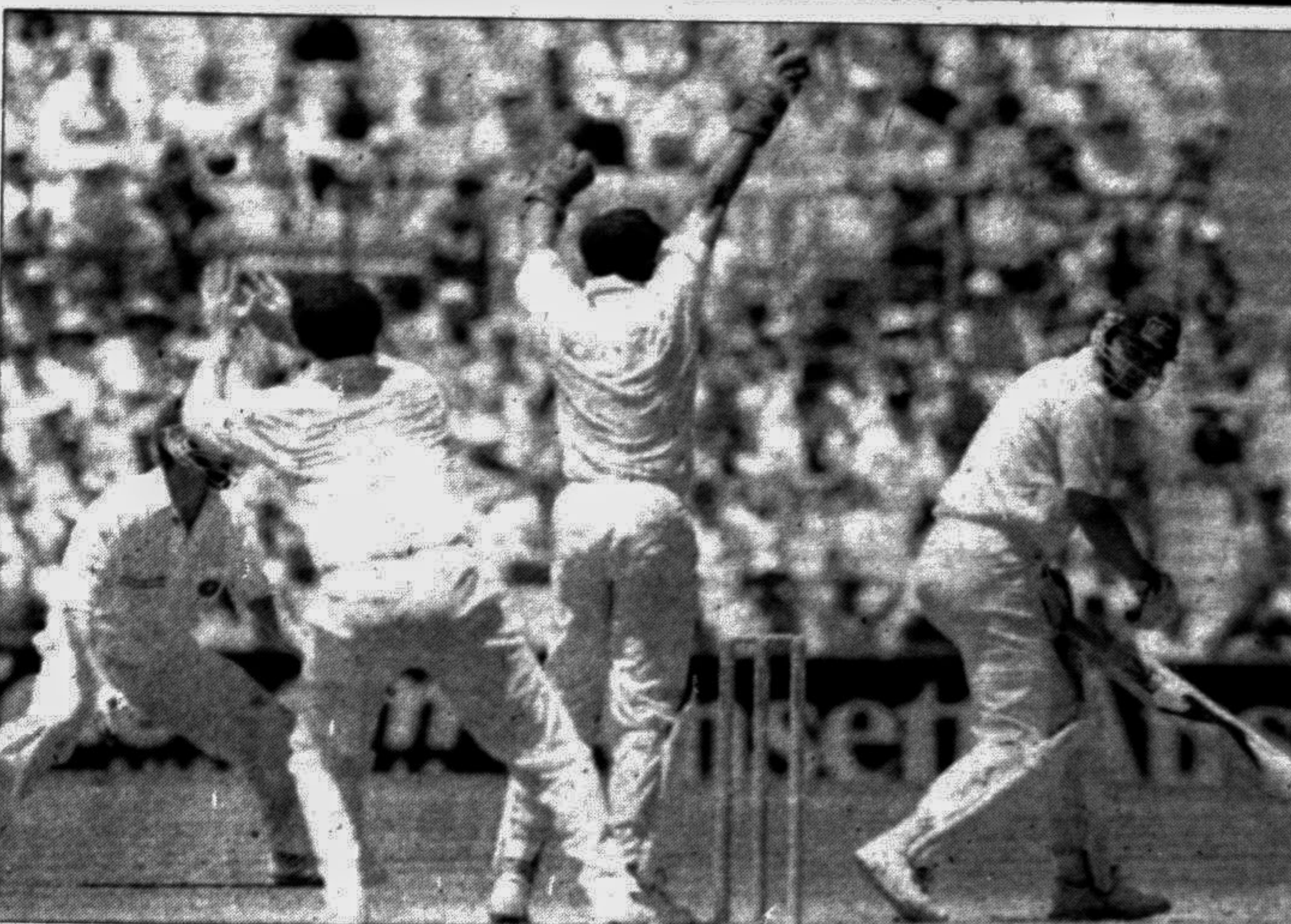
Australian batsman Mark Waugh turns to watch the ball after being dismissed leg before from South African bowler P Symcox for 7 on the second day of the second Test between Australia and South Africa in Sydney yesterday.

But he had been out of work since the Swiss club declined to renew his contract at the end of last season.