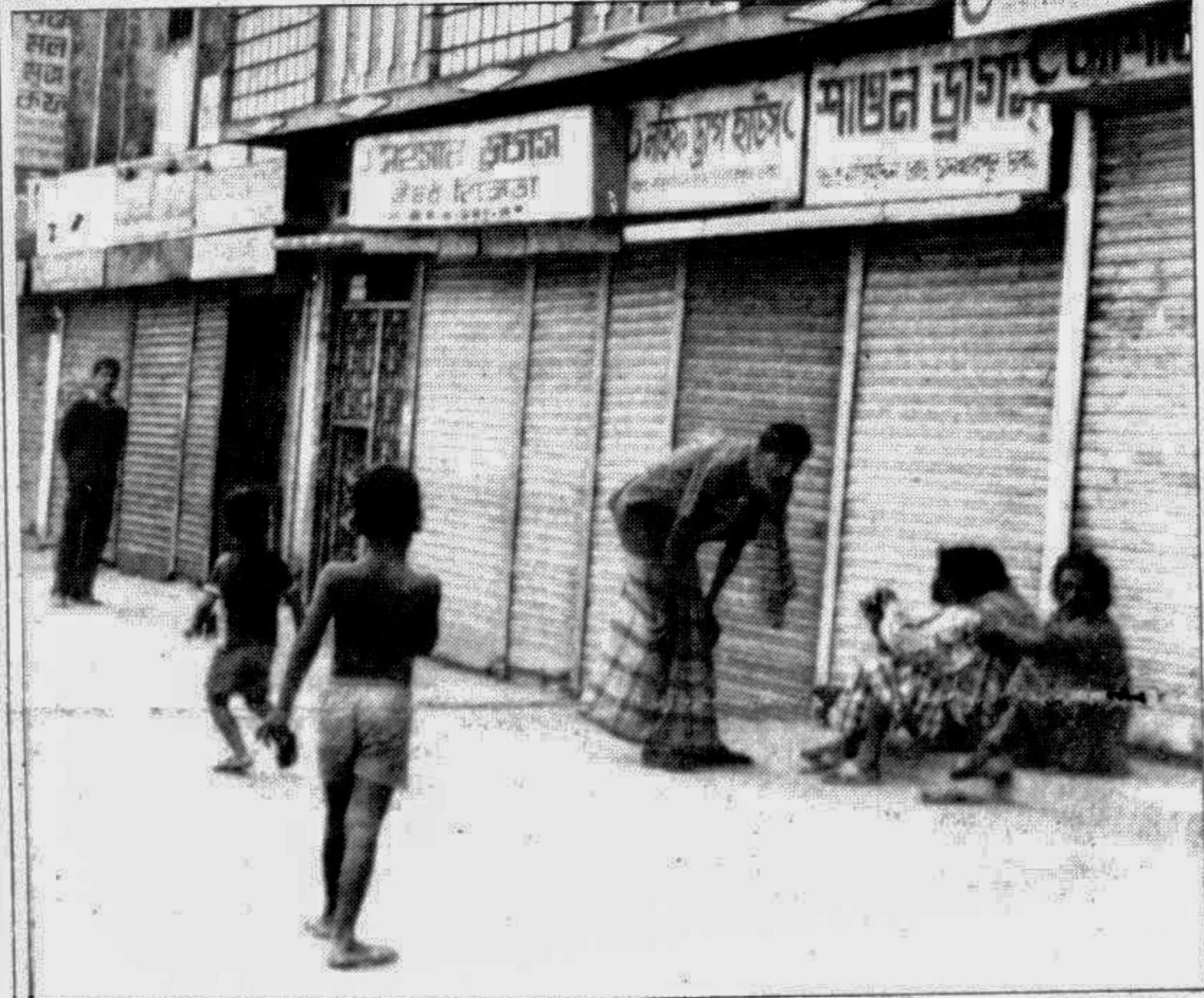
Drug stores at the Chankarpool area in the city remained closed yesterday, causing immense suffering to the patients at the nearby Dhaka Medical College Hospital. The Bangladesh Chemists' and Druggists' Samity called the day-long countrywide strike.