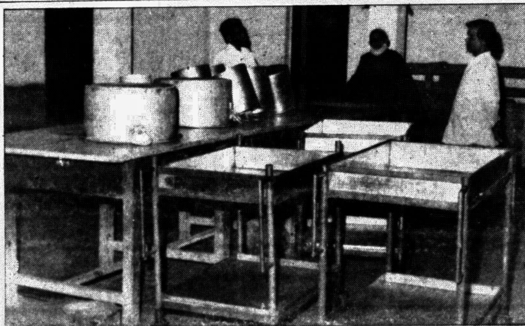
EMPTY KITCHEN: Caterers of the Mitford hospital yesterday went on strike demanding payment of arrear bills. As a consequence, no food was supplied to the patients.