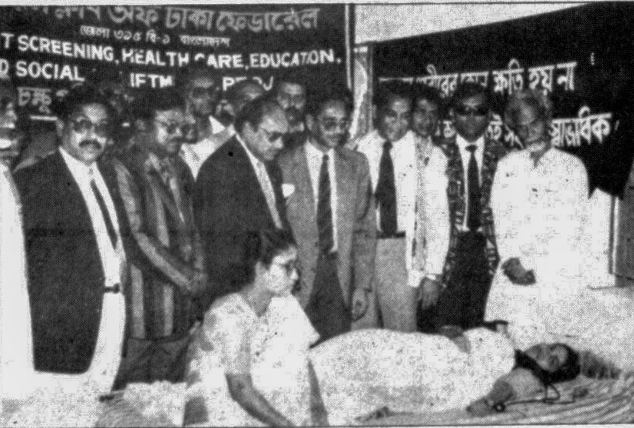
NARSINGDI: A voluntary eye and blood donation programme, organised by Lions Club of Dhaka, was recently inaugurated at Khidirpur College premises, Monohardi under the district. About 50 bags of blood were collected.