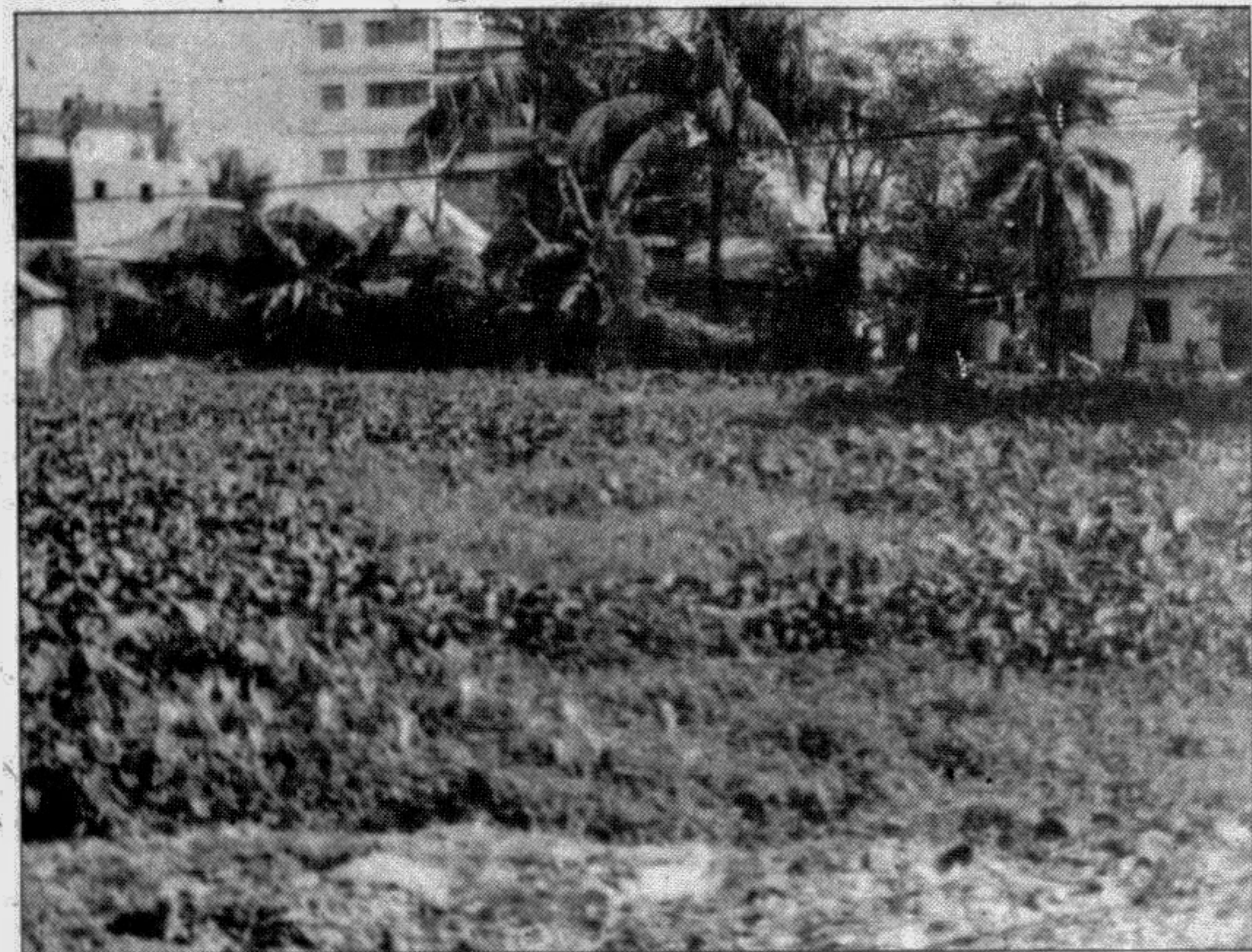
Plenty of water hyacinths, one of the breeding grounds of mosquitoes, lie in the middle of a residential area in the town.

effective, says one official, but timely spraying can halt growth of mosquito youngs consequently, resulting in efficient control of the growth of mosquitoes. A mosquito has a very short life span — only 30 days. They live 15 days as larvae, the young stage and the rest of the 15 days as adult, the active stage. Mosquitoes can be destroyed once measures to kill them is carried out efficiently. This process can not be carried out alone by the municipal authority.