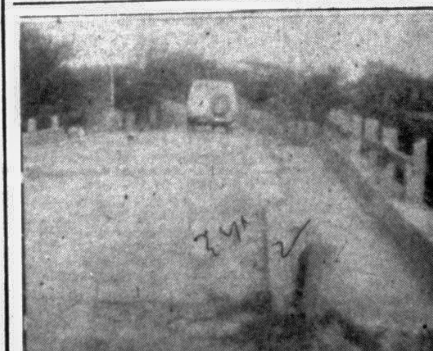
GOPALGANJ: A severely damaged road on Mukshedpur-Boraitala route under Mukshedpur thana. The bridge also needs reconstruction works for smooth traffic movement.

The river Inchemati has so far devoured 3,000 metres area in Debhata, 2500 ft in Kharhat and 3000 ft in Khanja.