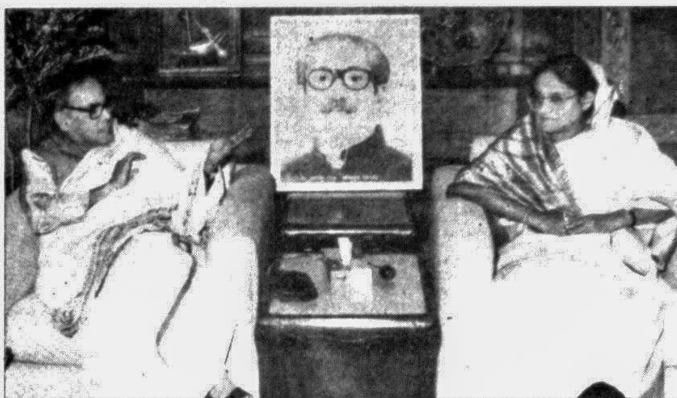
Indian Commerce Minister Pranab Mukherjee called on Leader of the Opposition in Parliament Sheikh Hasina at her Parliament office yesterday.

Even glittering shops are not invulnerable to such practices. Containers of luxury foreign brands are emptied first to fill with second-rate or spurious substances and sold at exorbitant prices. Only the customer's weakness for anything foreign is exploited. Fraud thy name is trade—this is how one is tempted to describe business world here.