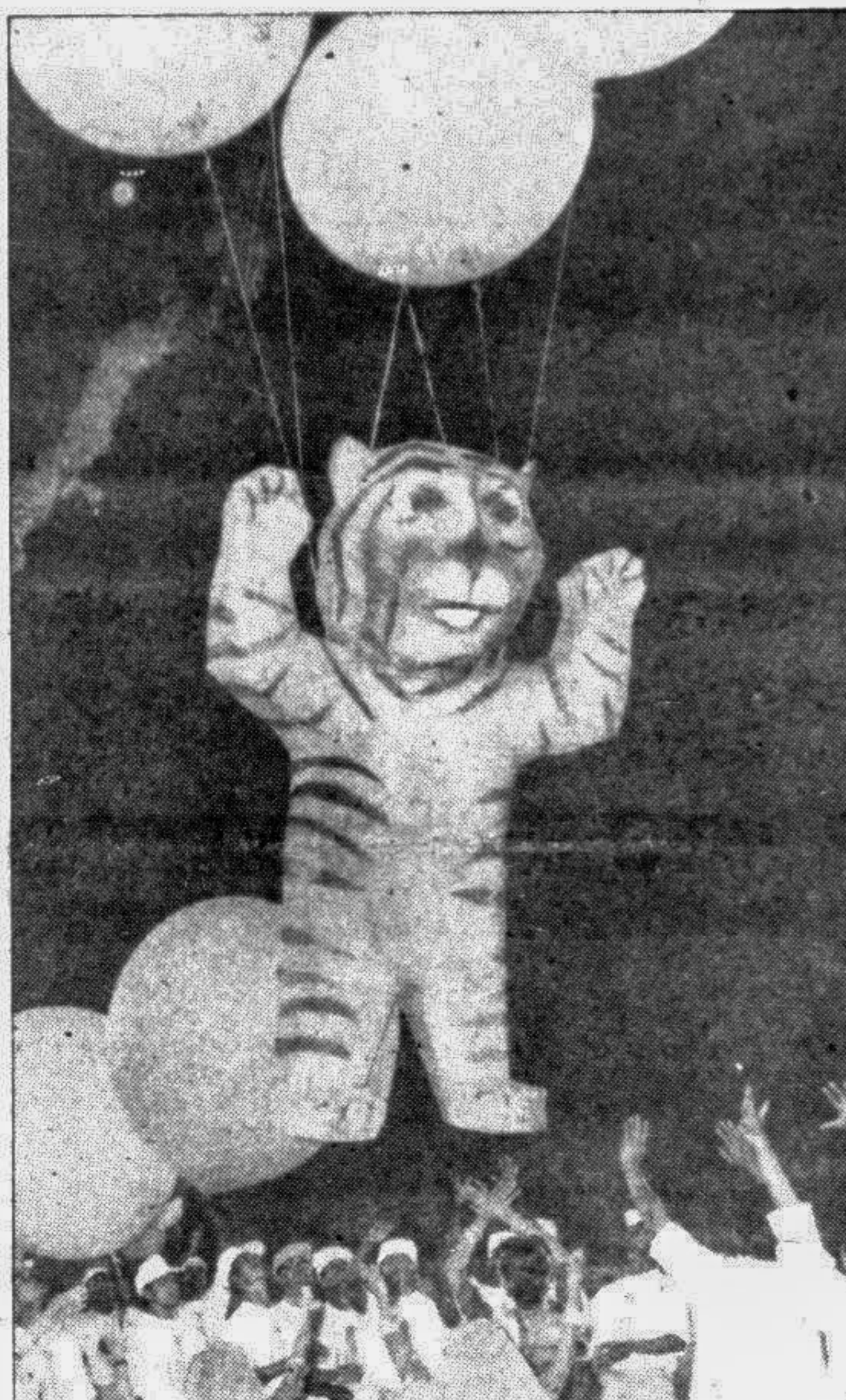
Balloons tied to Adanya, the mascot of the week-long Sixth SAF Games which concluded in the city yesterday, being released during the impressive closing ceremony at the Dhaka Stadium.

A flimsy version of Adanya was sent up in the air with a See Page 12 Col 2