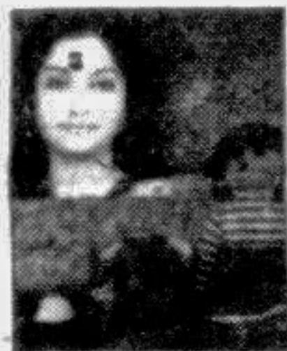
Dolls' World Page 3