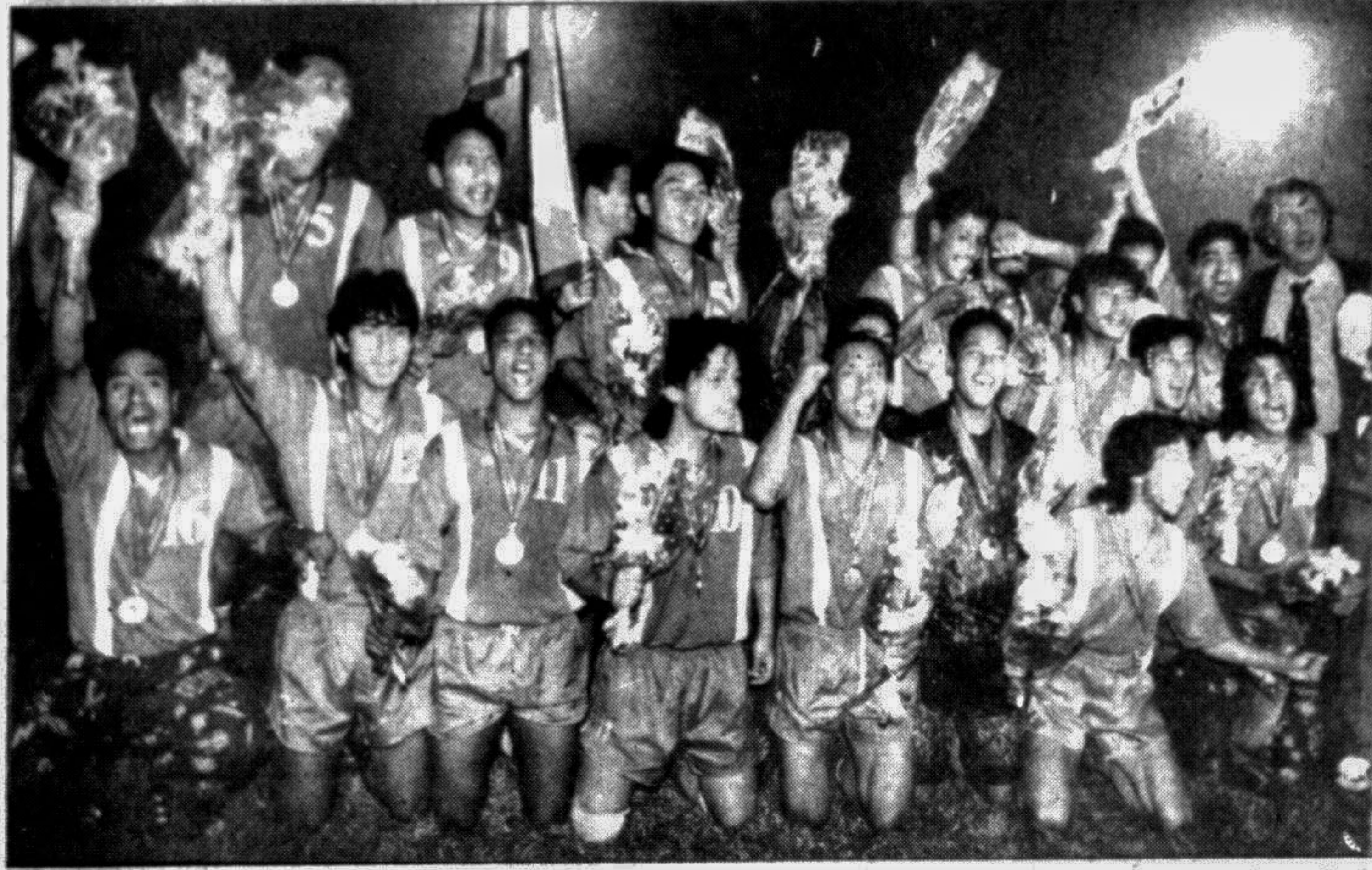
WE'VE WON IT: The Nepalese booters relishing the moment after beating India 4-3 in an exciting tie-breaker of the Sixth SAF Games football final at the Mirpur Stadium yesterday.