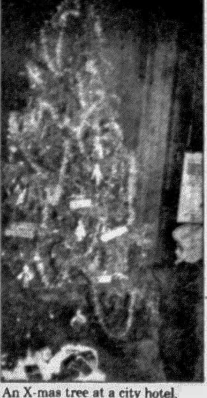
An X-mas tree at a city hotel.

The Daily Star wishes the Christian community a Happy Christmas.