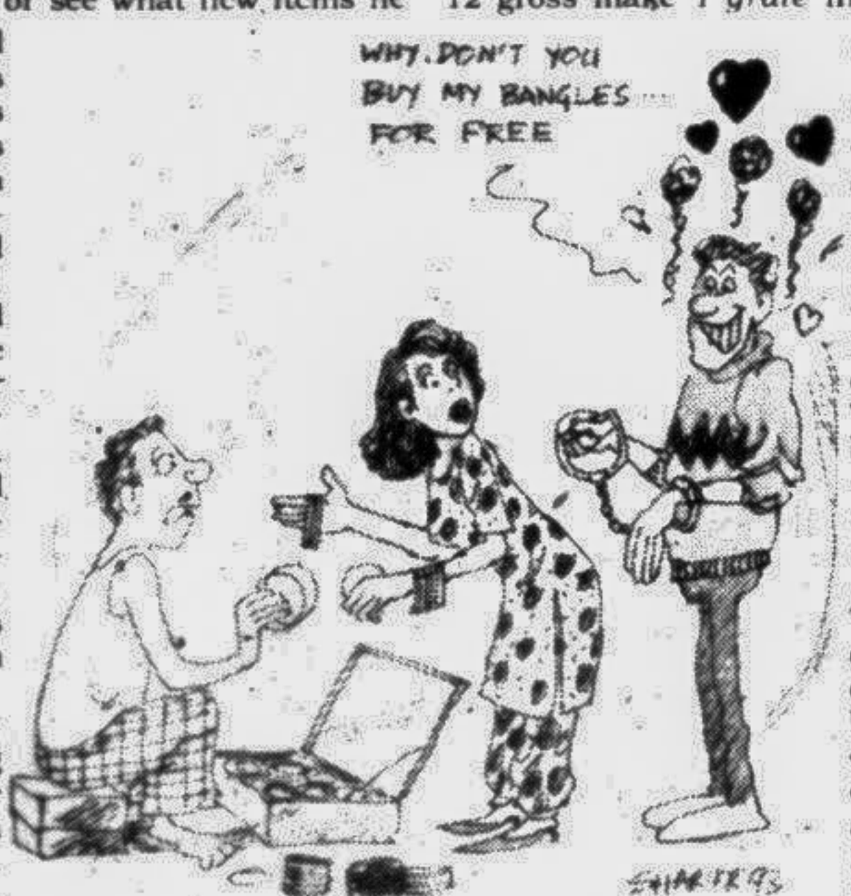
WHY DON'T YOU BUY MY BANGLES FOR FREE