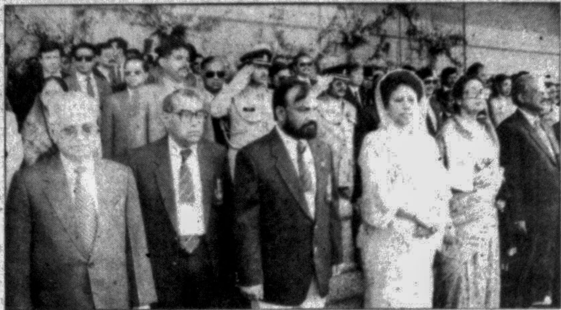
President Abdul Rahman Biswas and Prime Minister Begum Khaleda Zia stand in attention while the national anthem is played during the inaugural ceremony of the VI SAF Games at the Dhaka Stadium yesterday. Also seen are Games Organising Committee chief Finance Minister M Saifur Rahman, State Minister for Youth and Sports Sadek Hossain and president of the Bangladesh Olympic Association Gias Kamal Chowdhury.

launched a scathing attack on Rao after the Congress lost elections to legislatures in two northern states this month. But observers say Bangarappa had been sidelined in the Congress and was itching to get out. He could now try to forge an alliance with a political party representing poor castes that has come to power in the politically important state of Uttar Pradesh. The destruction of the Babri Mosque in Ayodhya on Dec 6, 1992 by Hindu zealots angered the minority Muslim voters. Many of them turned away from the Congress, blaming it for failing to protect the mosque. Earlier this month, Rao also fired a junior minister in his cabinet after he blamed the Prime Minister for leading a lacklustre election campaign.