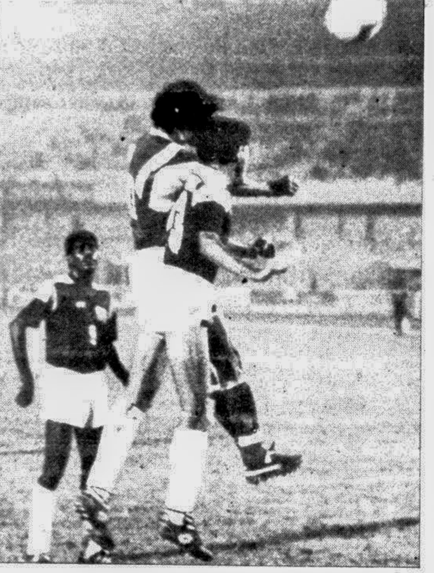
Scene from yesterday's SAF football opener between Shri Lanka and Pakistan. Shri Lanka beat two-time champions and reigning holders Pakistan by 2-1. — Star photo

The goal galvanised the Lankan squad into the offensive once and Ranawera of Shri Lanka's Renown Sporting Club restored parity in the 32nd minute, by a ground shot from the left wing (1-1).