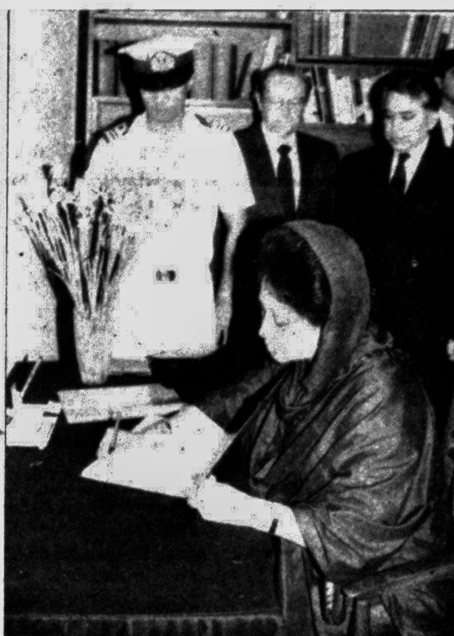
Prime Minister Begum Khaleda Zia signing the condolence book opened at the death of the Prime Minister of Hungary Jozsef Antall at the Hungarian Embassy at Gulshan yesterday. Hungarian Charge d' Affaires I B Buday was present.