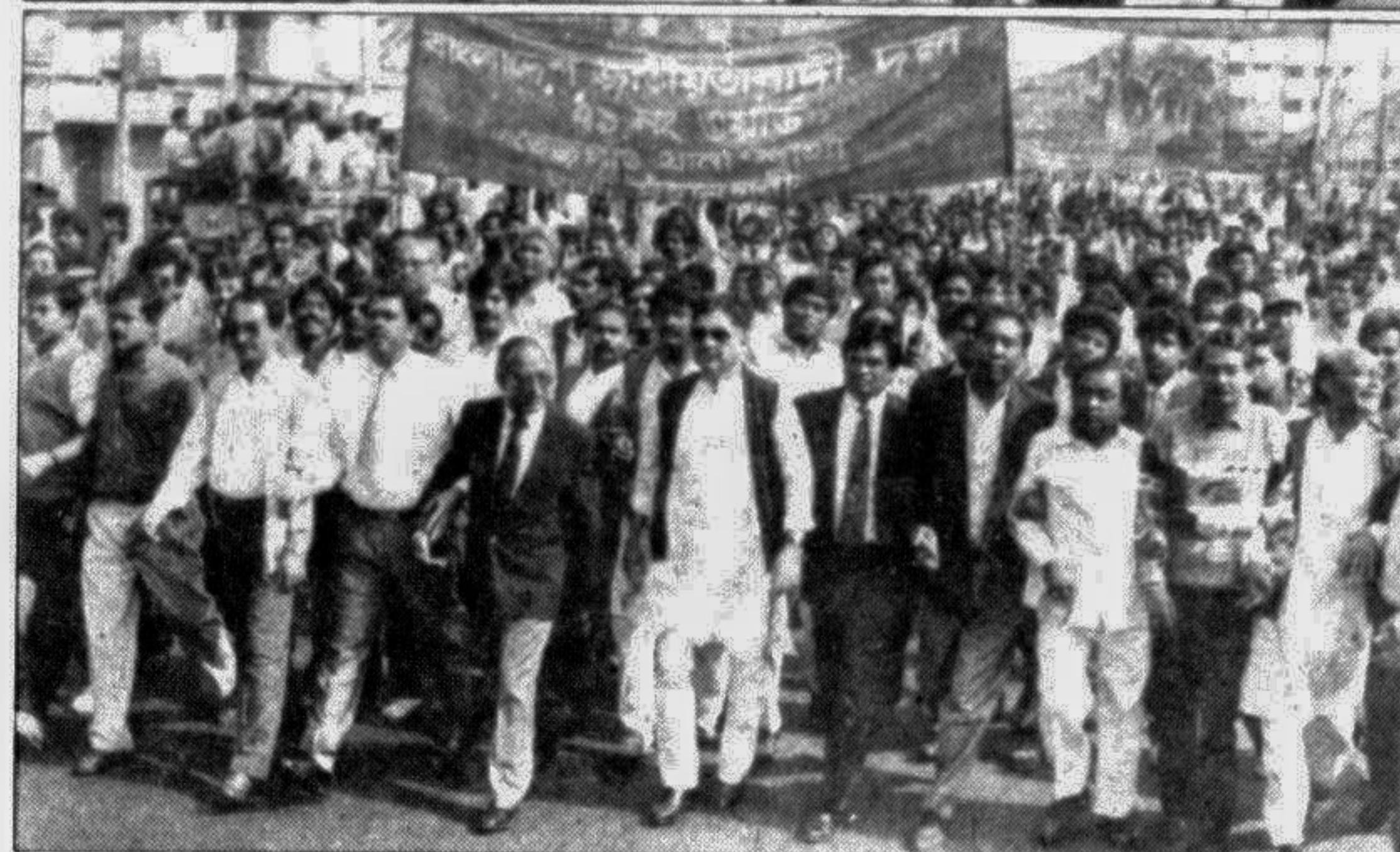
Awami League chief Sheikh Hasina leading a procession in the city Thursday on the occasion of the Victory Day (top), and the BNP Dhaka city unit procession on the Victory Day (above)