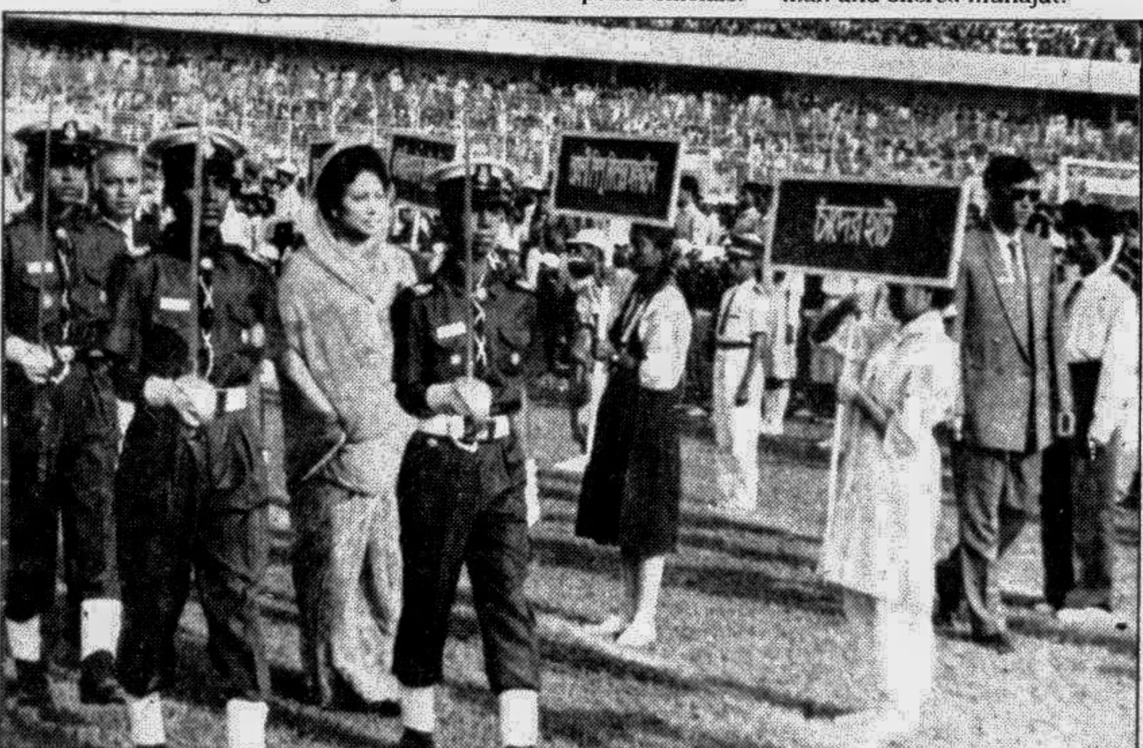
Prime Minister Begum Khaleda Zia inspecting the juvenile rally at the Mirpur Stadium on the Victory Day Thursday.

Earlier, the Prime Minister, along with her party colleagues, went to the mazar of the late President Ziaur Rahman and offered munajat.