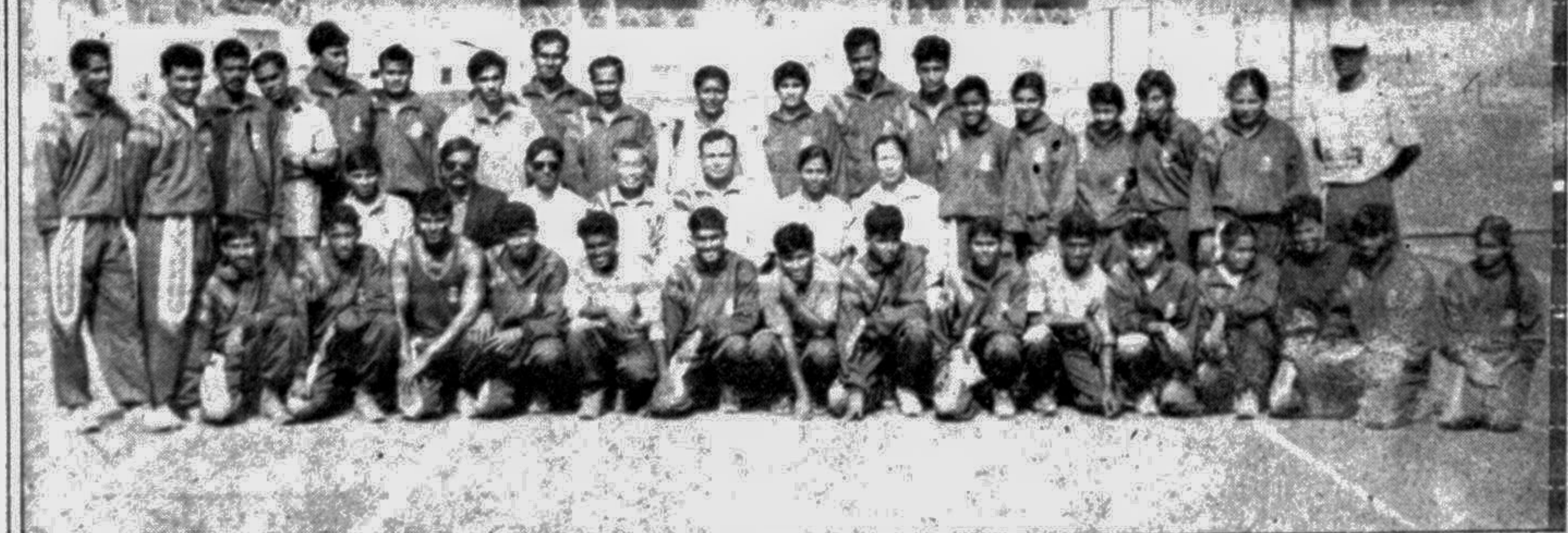
The full contingent of the Bangladesh athletics team for the sixth SAF Games scheduled to be held in Dhaka from December 20 to 27. Although Indians are likely to sweep the track and field events Bangladeshi athletes who have undergone rigorous training under Chinese trainers are tipped to spring sporadic surprises.

In the closing minutes John Barnes shot over the bar and Fowler and McManaman both had attempts turned away before Segers' own goal blunder.