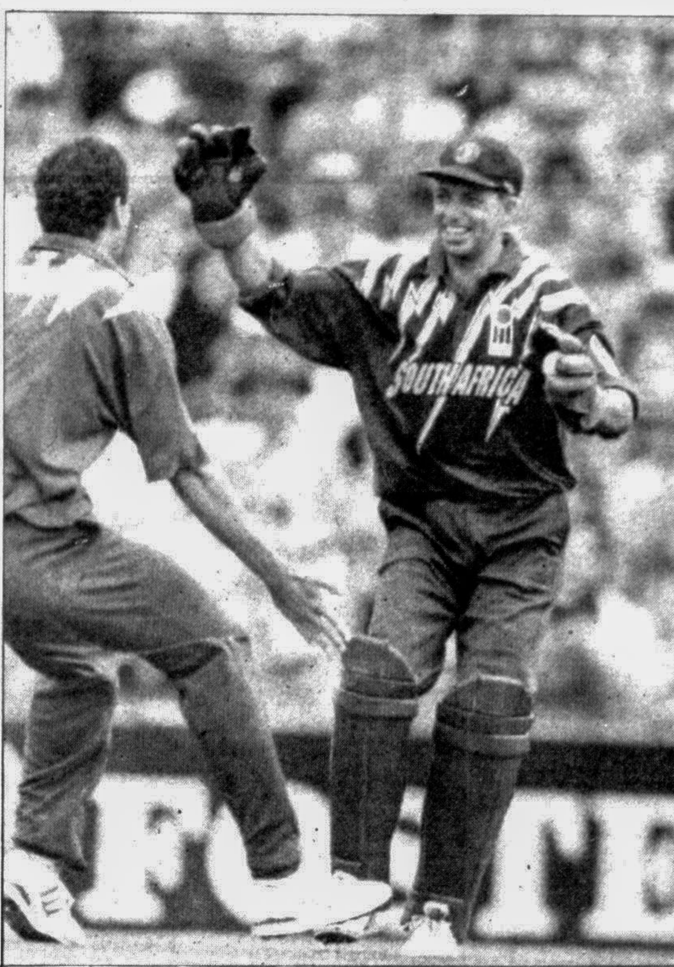
South African bowler Hansie Cronje (L) congratulates his teammate wicketkeeper Dave Richardson on taking a smart catch to dismiss Australian batsman Steve Waugh during their one-day World Series match in Sydney yesterday.

Leeds remained second in the championships one point ahead of Blackburn but a massive 13 behind Manchester United.