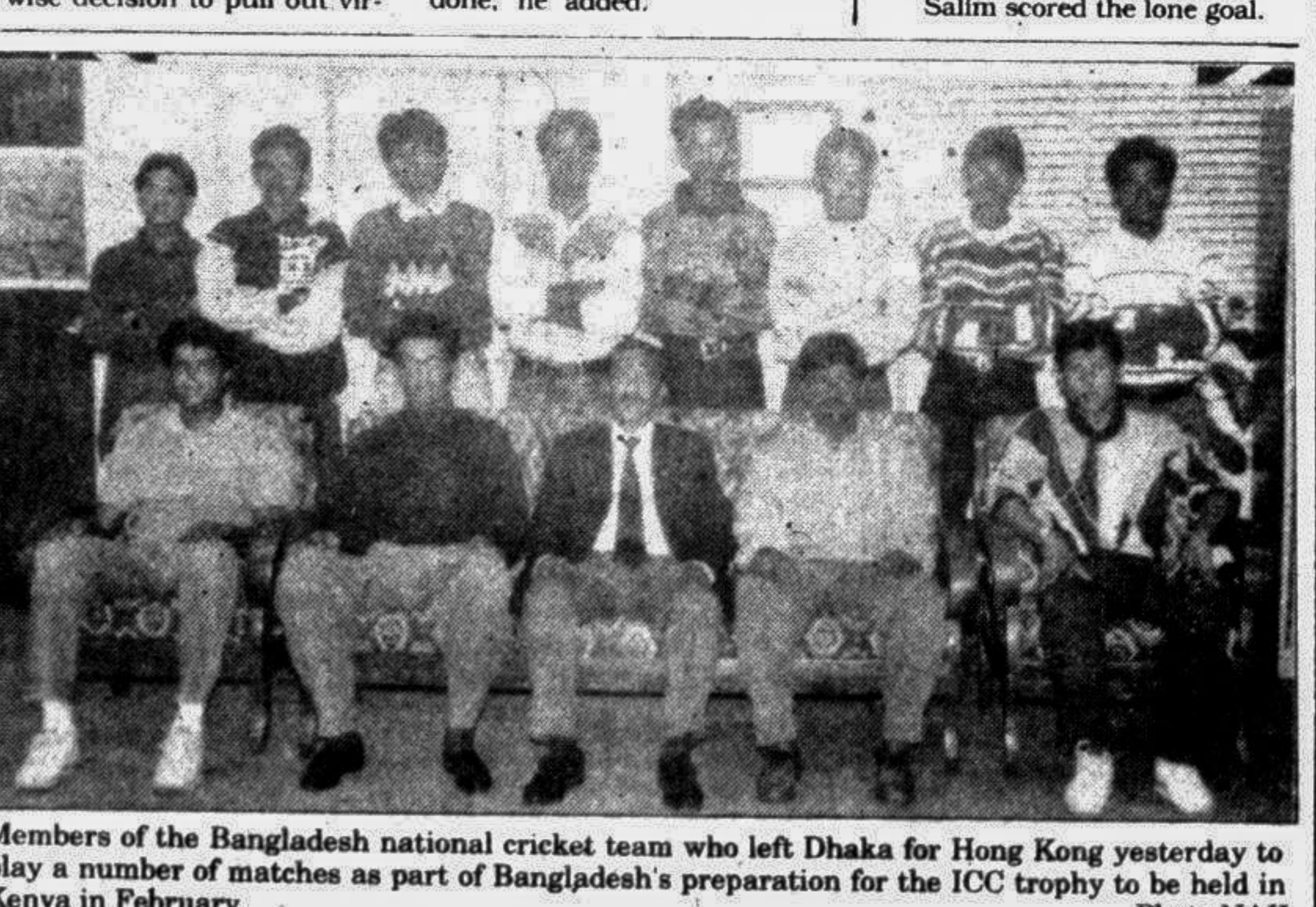
Members of the Bangladesh national cricket team who left Dhaka for Hong Kong yesterday to play a number of matches as part of Bangladesh's preparation for the ICC trophy to be held in Kenya in February.