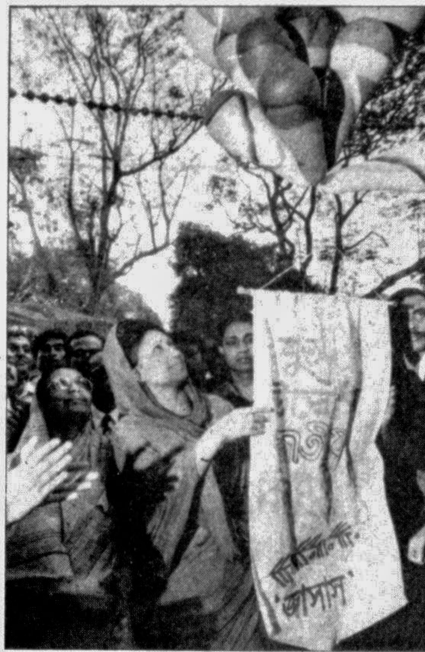
Prime Minister Begum Khaleda Zia inaugurating a four-day 'National Victory Festival' organised by the Jatiyatabadi Samajik Sangskritik Sangstha (JASAS) in celebration of the 23rd Victory Day at the Ramna Batamul in Dhaka yesterday.

Pressler was snubbed when he visited Pakistan early last year, his meeting with former President Ghulam Ishaq Khan being cancelled at the last minute. [Earlier Story on Page 5]