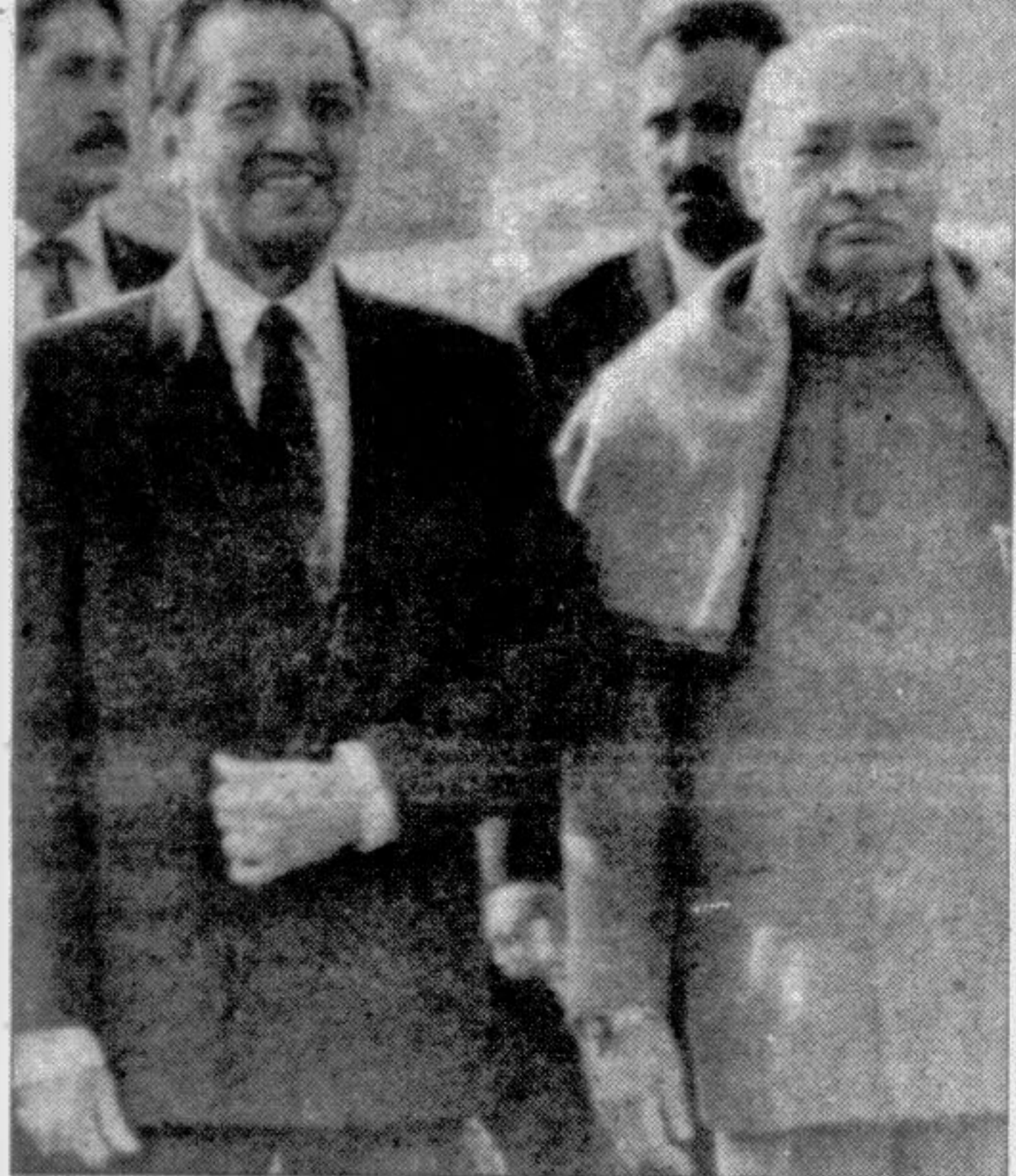
Malaysian Prime Minister Mahathir Mohamed (L) and his Indian counterpart P V Narasimha Rao walk upon Mahathir's arrival at Rashtrapati Bhavan (Presidential Palace) on Monday in New Delhi.

Tremor hits Assam: Assam-Bhutan border areas yesterday experienced a moderate tremor of 5.0 degree intensity on the Richter scale, meteorological officials said, PTI reports from New Delhi.