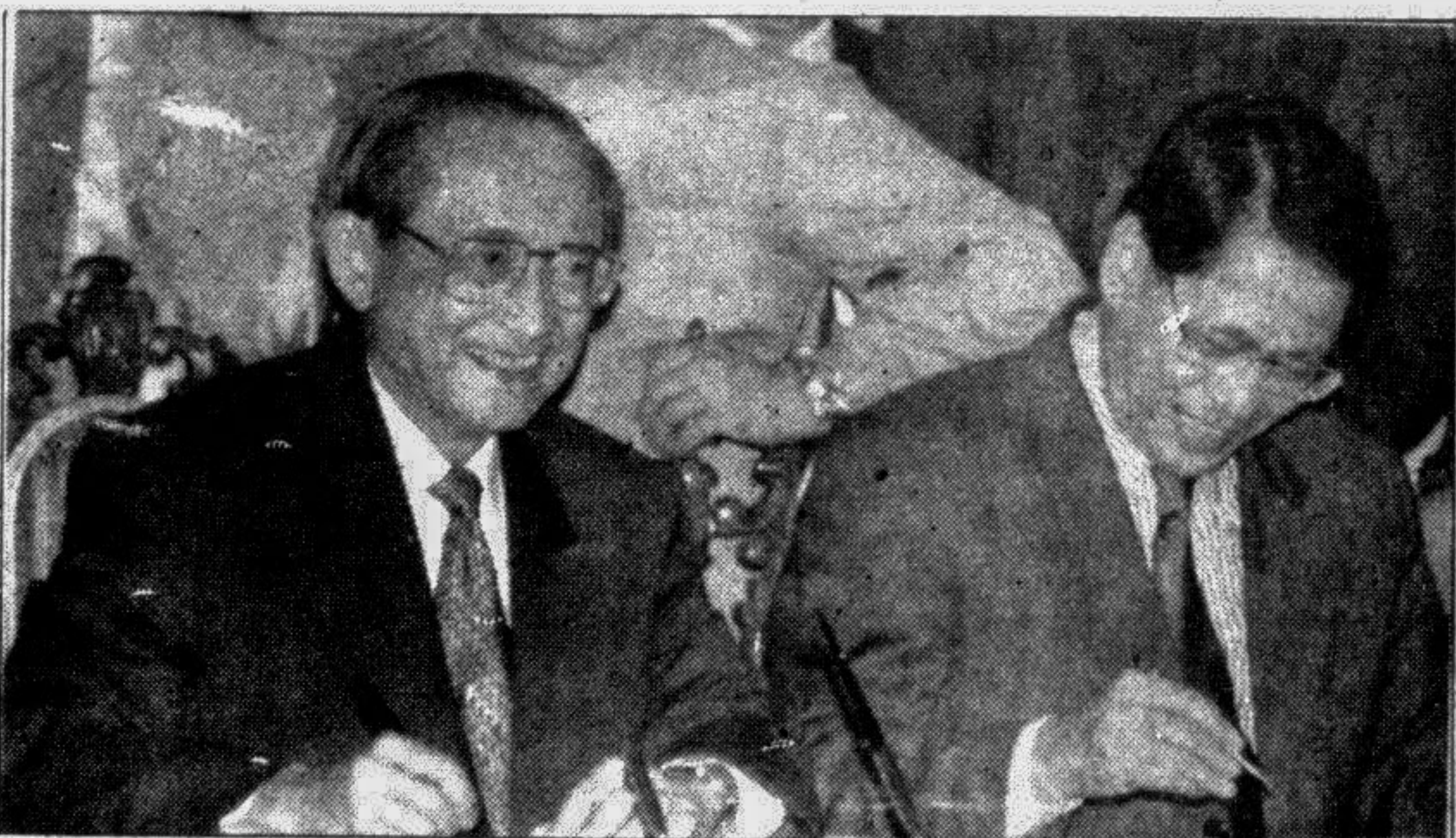
President Fidel Ramos (L) signs into law a controversial bill restoring the death penalty for 'heinous crimes' at a ceremony in Malacanang Palace on Monday. At right is Senate President Edgardo Angara.

MANILA, Dec 13: President Fidel Ramos signed legislation Monday reimposing the death penalty, terming it an essential step to protect Philippine society from "the most heinous offenders of our laws," reports AP.