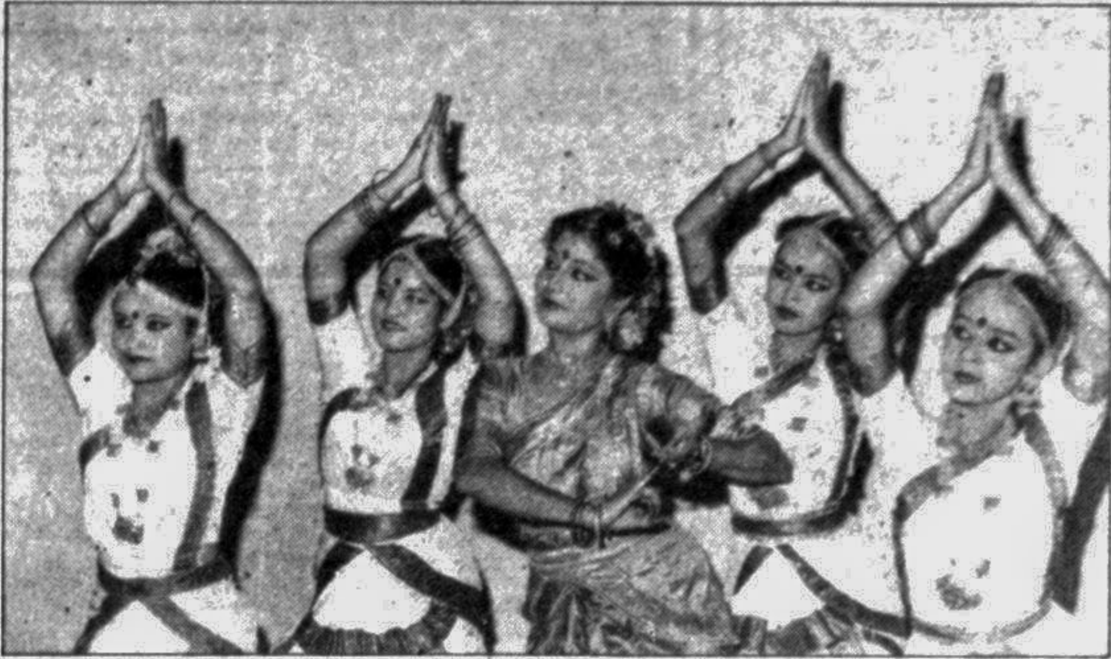
Dancers performing during the cultural evening organised by the Greater Mymensingh Zilla Samity at the Institution of Engineers yesterday.