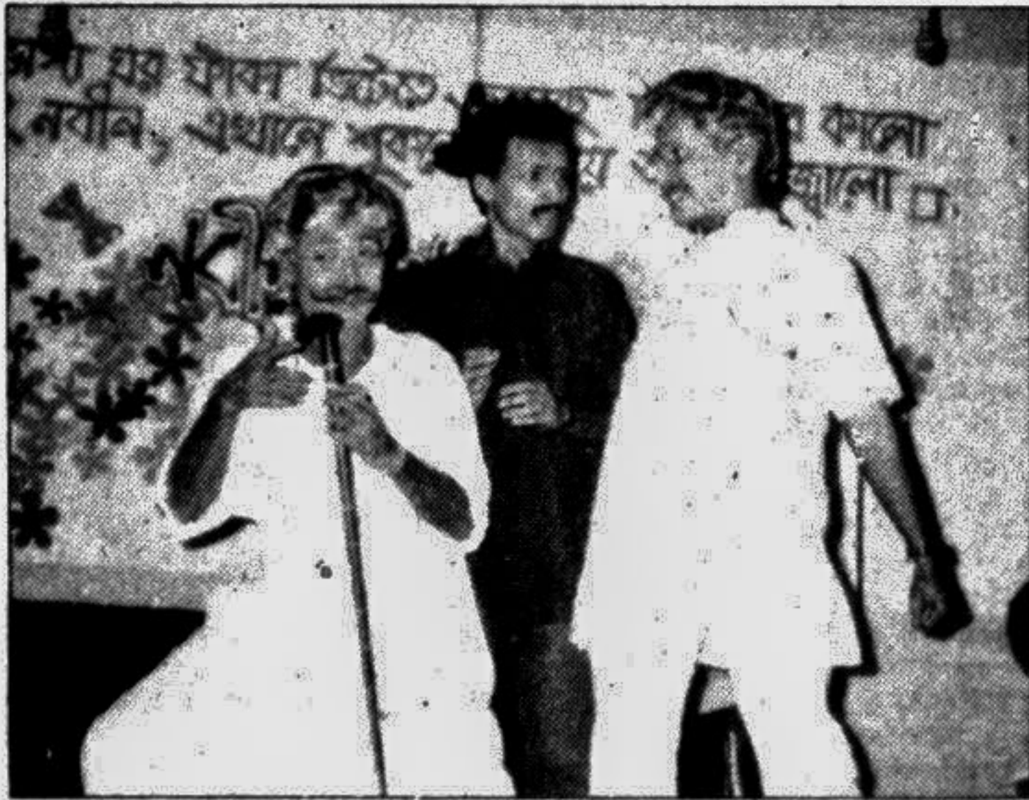
A scene of a play 'Crossfire in the Crossroad' staged at the Dhaka Medical College auditorium recently. The Medicos, a drama group of the college, arranged the theatrical production.