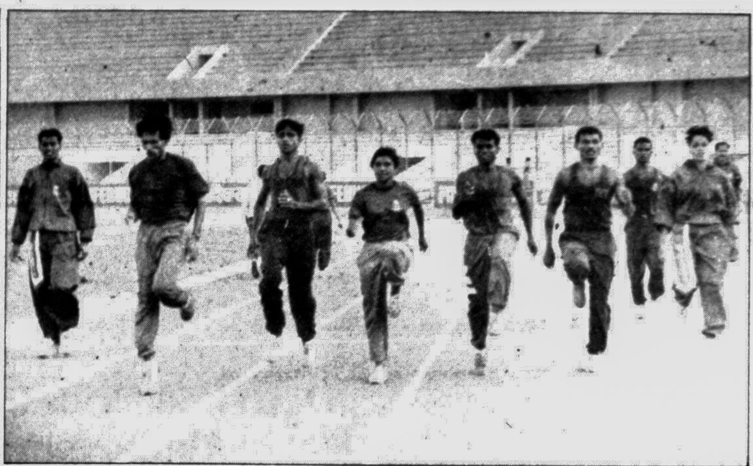
Athletes being put through their paces in a training session for SAF Games at the Mirpur Stadium yesterday.

"I saw guys I felt like I could beat right then in the semifinals," McEnroe said and (Cedric) Pioline was in the final, so you say, what is going on here?