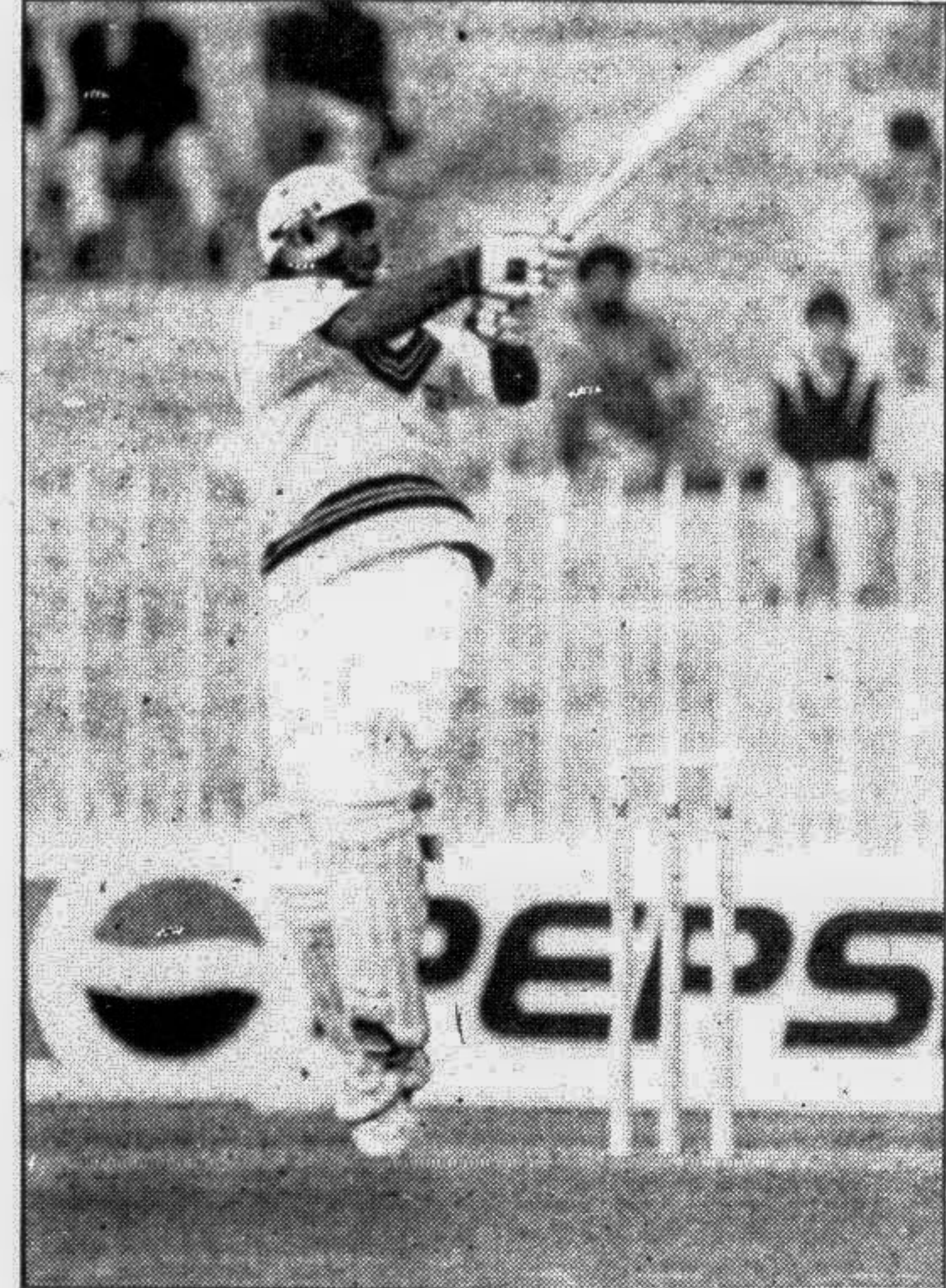
Pakistani batsman Basit Ali hooks the ball to the boundary on the first day of the second Test against Zimbabwe in Rawalpindi on Dec 9.