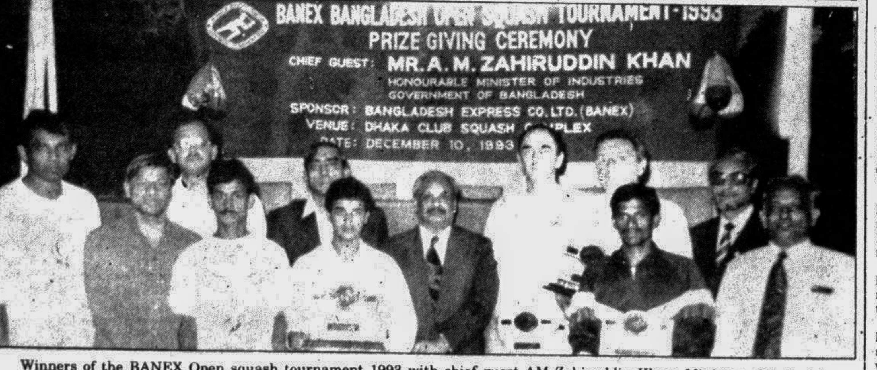
Winners of the BANEX Open squash tournament 1993 with chief guest AM Zahiruddin Khan, Minister of Industries, president and officials of BSRF and the sponsor of the tournament, Bangladesh Express Co Ltd (BANEX).